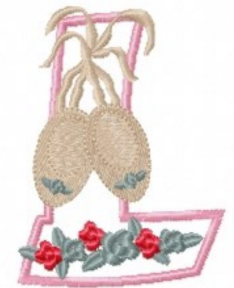
File: BalletalphaL.jef Stitches: 8224 Size: 74.3x99.4 mm