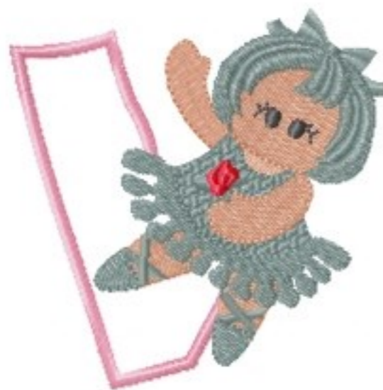
File: BalletalphaV.jef Stitches: 11246 Size: 99.0x98.5 mm