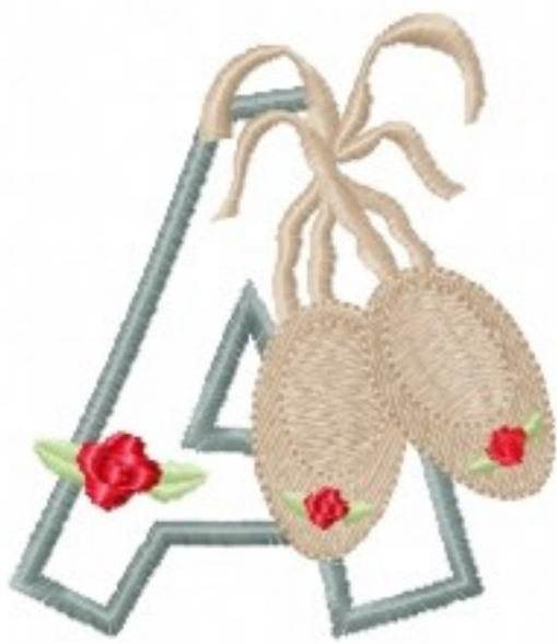
File: BalletalphaA.jef Stitches: 8046 Size: 87.6x99.3 mm