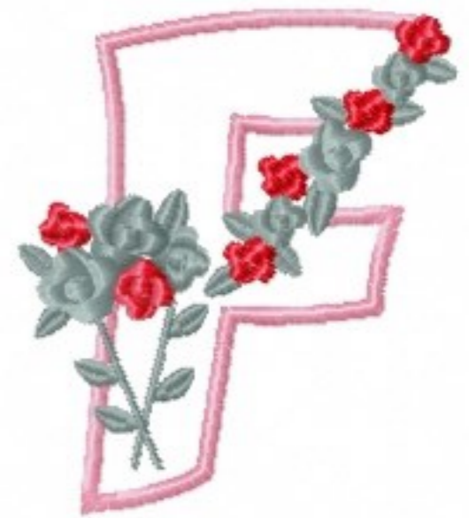
File: BalletalphaF.jef Stitches: 5923 Size: 86.9x98.8 mm