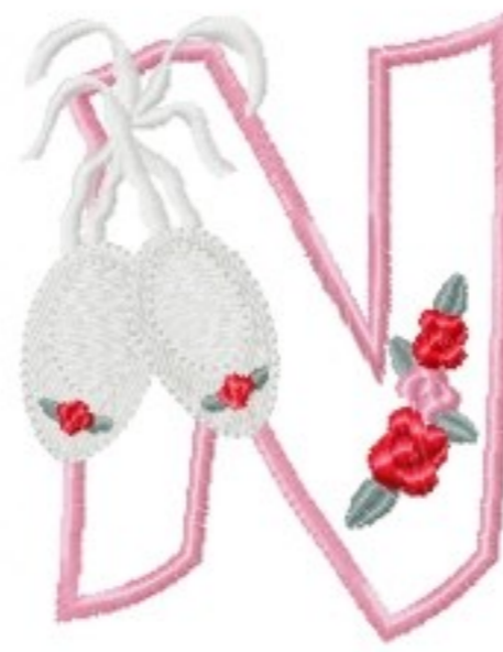
File: BalletalphaN.jef Stitches: 8028 Size: 79.3x99.0 mm