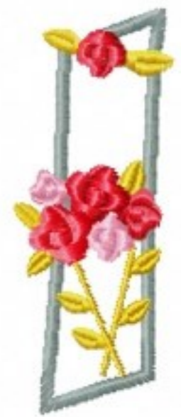
File: BalletalphaI.jef Stitches: 3725 Size: 39.7x99.1 mm