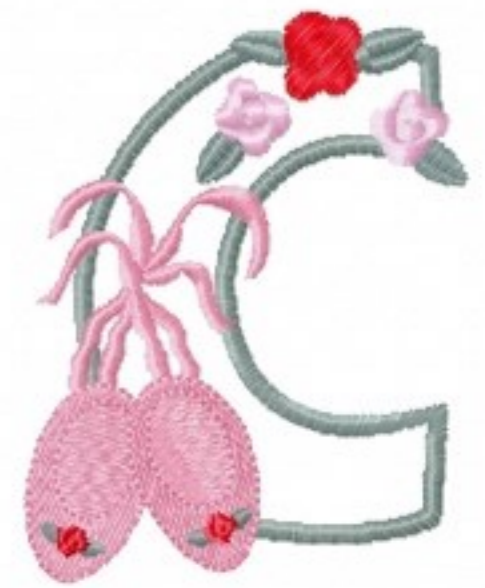
File: BalletalphaC.jef Stitches: 7688 Size: 78.3x99.8 mm