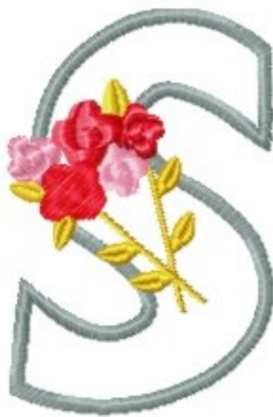
File: BalletalphaS.jef Stitches: 4729 Size: 66.0x99.4 mm