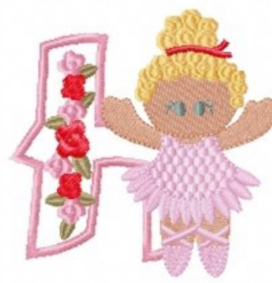
File: BalletalphaH.jef Stitches: 12439 Size: 99.7x98.2 mm