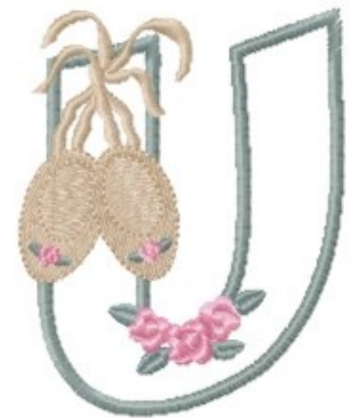
File: BalletalphaU.jef Stitches: 7838 Size: 80.2x99.2 mm