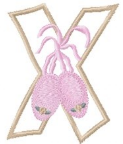
File: BalletalphaX.jef Stitches: 6943 Size: 80.2x99.0 mm