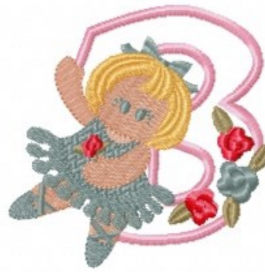
File: BalletalphaB.jef Stitches: 12594 Size: 99.6x99.1 mm