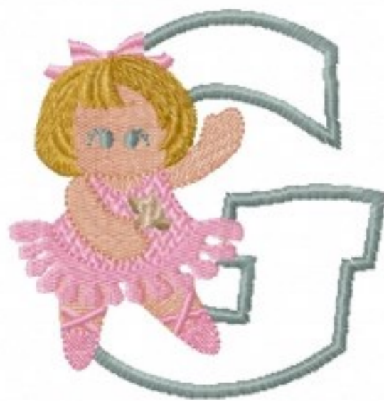
File: BalletalphaG.jef Stitches: 10998 Size: 96.3x97.5 mm