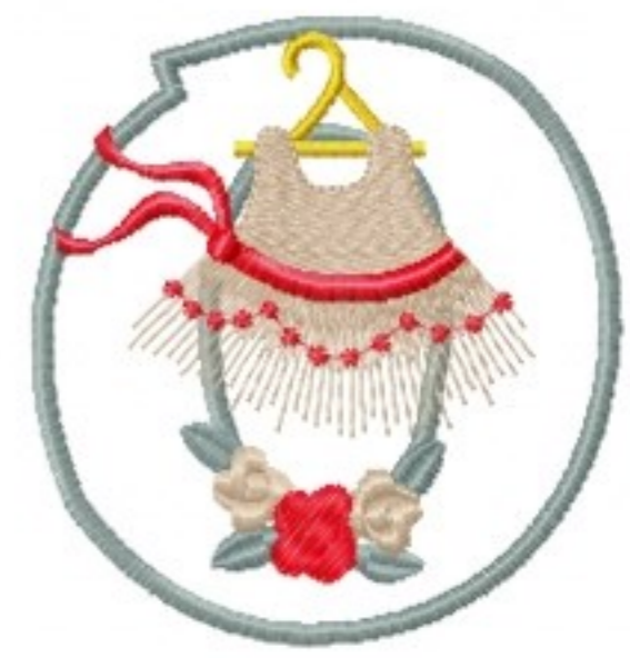
File: BalletalphaO.jef Stitches: 7695 Size: 94.6x99.4 mm