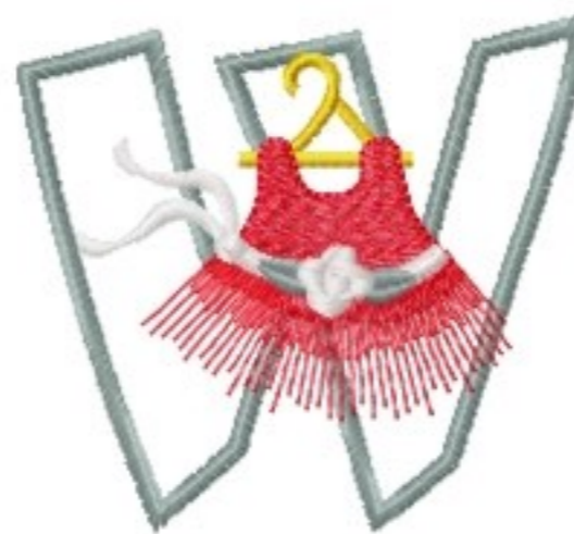
File: BalletalphaW.jef Stitches: 6412 Size: 99.0x87.5 mm