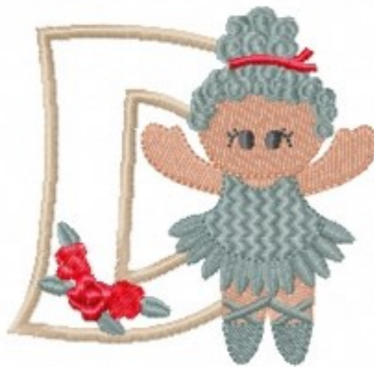
File: BalletalphaD.jef Stitches: 10784 Size: 97.5x93.1 mm