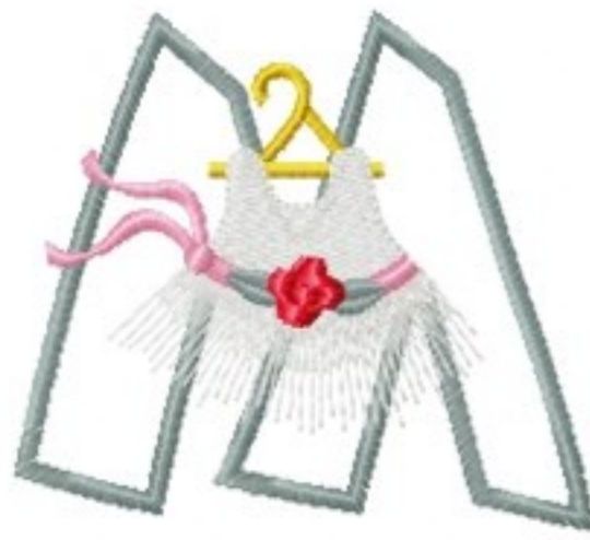
File: BalletalphaM.jef Stitches: 6457 Size: 99.1x87.5 mm