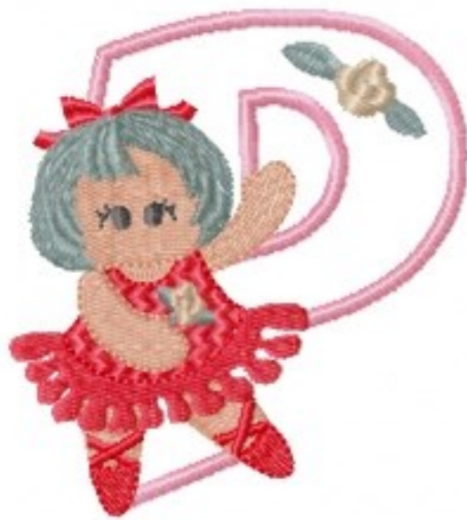
File: BalletalphaP.jef Stitches: 10752 Size: 91.4x99.8 mm