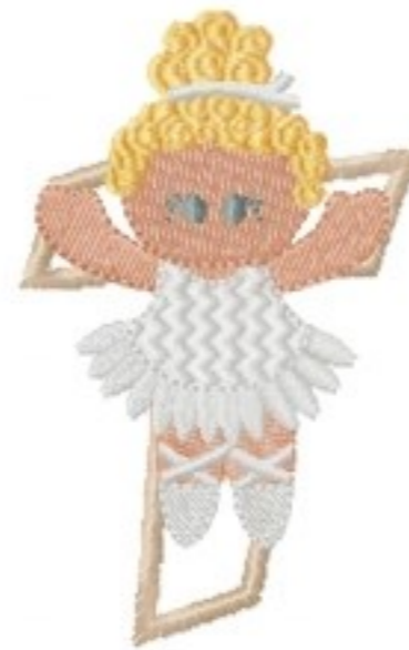
File: BalletalphaT.jef Stitches: 8190 Size: 63.3x98.7 mm