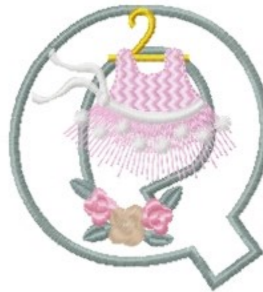
File: BalletalphaQ.jef Stitches: 7563 Size: 92.2x99.4 mm