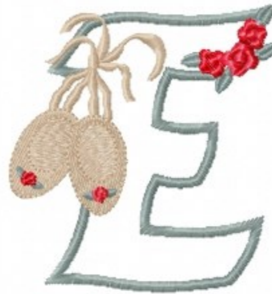
File: BalletalphaE.jef Stitches: 7952 Size: 92.8x98.7 mm