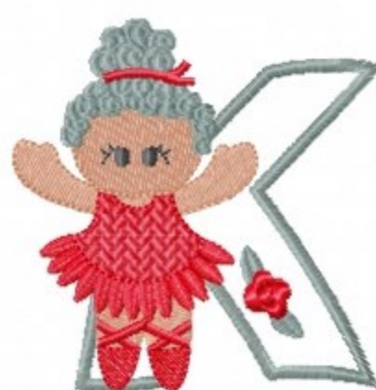
File: BalletalphaK.jef Stitches: 11281 Size: 98.1x97.8 mm