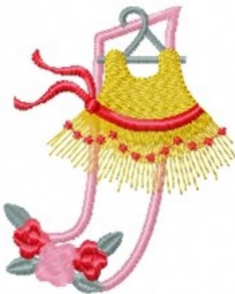
File: BalletalphaJ.jef Stitches: 6140 Size: 81.0x98.9 mm