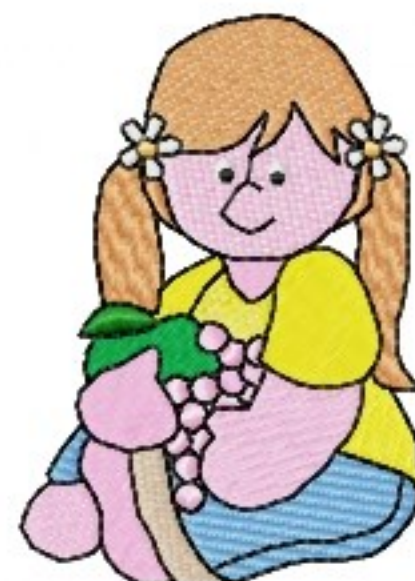
File: mxmas-69.jef Stitches: 10131 Size: 61.8x86.9 mm