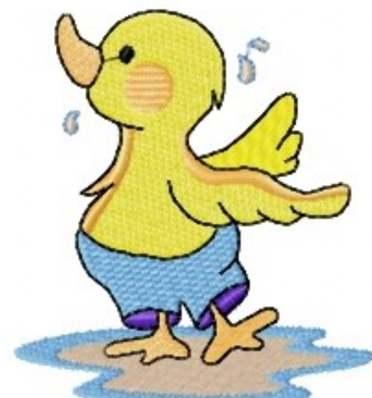
File: mxmas-63.jef Stitches: 8913 Size: 83.0x89.3 mm