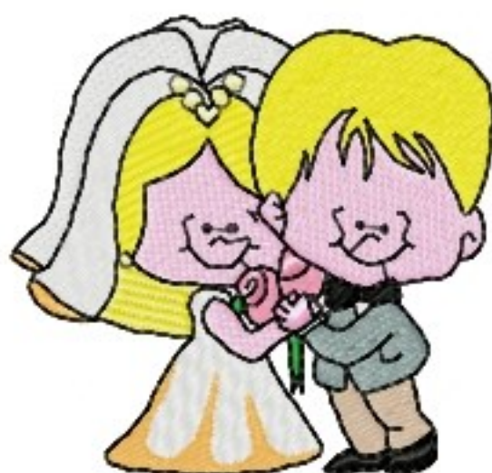
File: mxmas-44.jef Stitches: 12033 Size: 82.1x76.8 mm