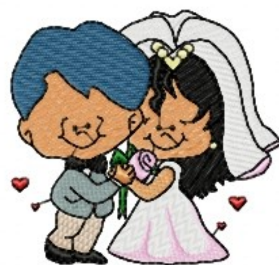
File: mxmas-45.jef Stitches: 12725 Size: 85.1x78.6 mm