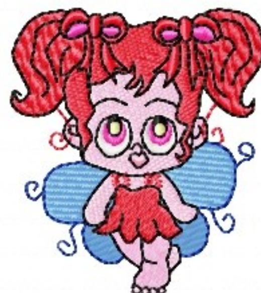
File: mxmas-42.jef Stitches: 12340 Size: 73.1x81.9 mm