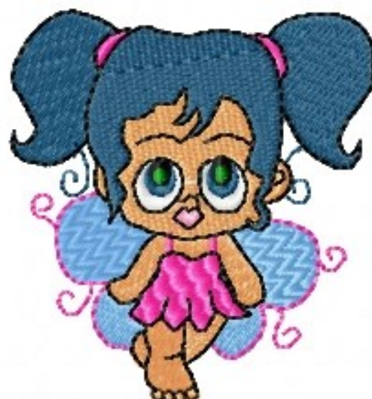
File: mxmas-40.jef Stitches: 10294 Size: 75.3x80.1 mm