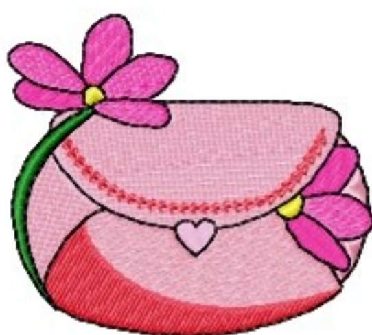
File: mxmas-38.jef Stitches: 9744 Size: 85.0x73.7 mm