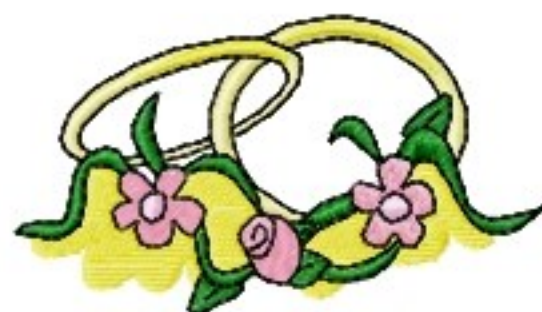
File: mxmas-43.jef Stitches: 7442 Size: 92.0x50.5 mm