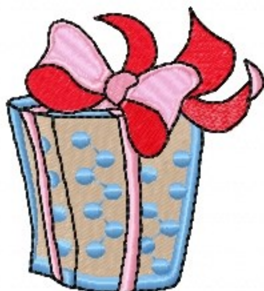
File: mxmas-64.jef Stitches: 10763 Size: 75.5x82.9 mm