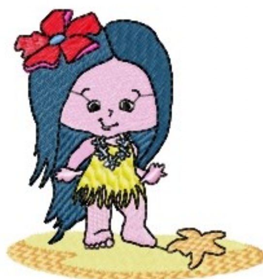
File: mxmas-61.jef Stitches: 11526 Size: 83.7x87.0 mm