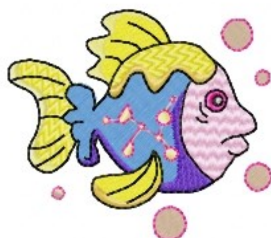
File: mxmas-62.jef Stitches: 9644 Size: 87.9x75.7 mm