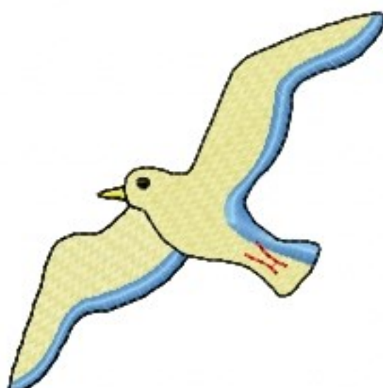
File: mxmas-70.jef Stitches: 5160 Size: 97.3x97.2 mm