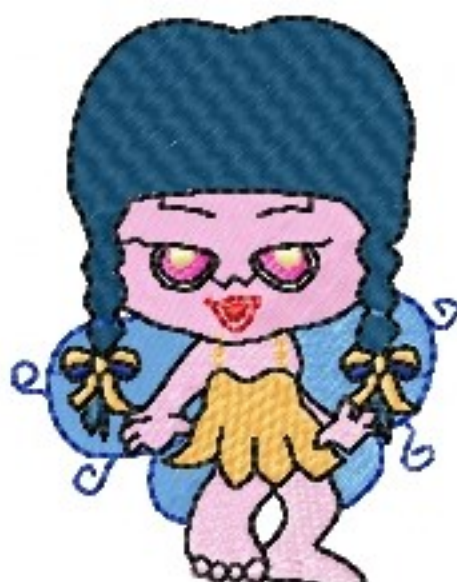
File: mxmas-41.jef Stitches: 10223 Size: 67.3x85.0 mm