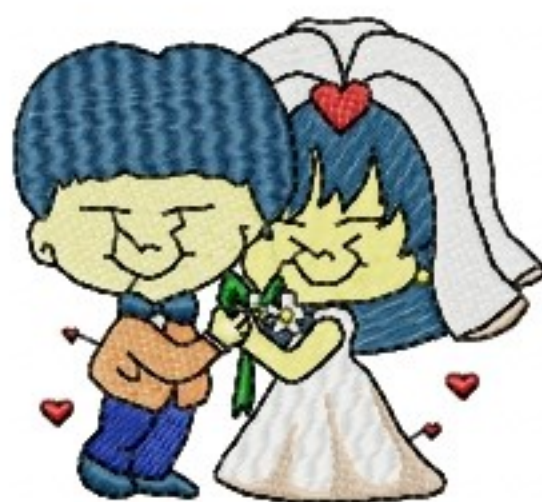
File: mxmas-46.jef Stitches: 11722 Size: 82.9x74.4 mm