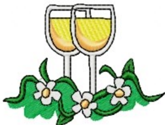
File: mxmas-47.jef Stitches: 8962 Size: 92.9x68.5 mm