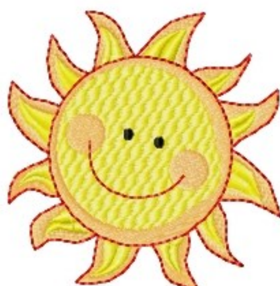
File: mxmas-65.jef Stitches: 10675 Size: 82.8x83.1 mm