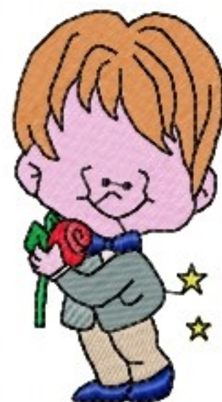
File: mxmas-48.jef Stitches: 8486 Size: 51.9x95.1 mm