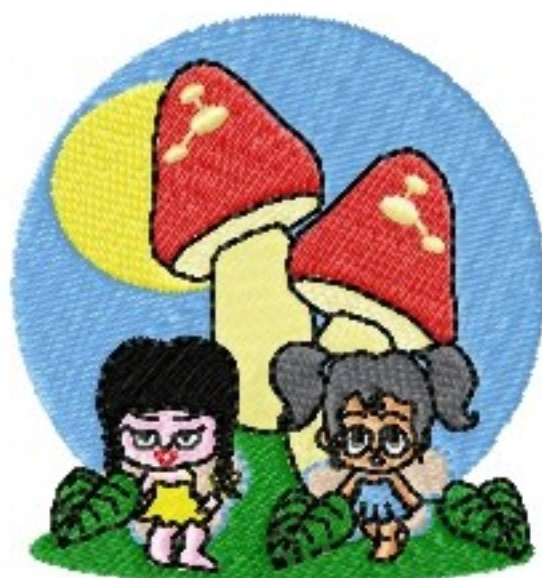
File: mxmas-37.jef Stitches: 13637 Size: 73.0x77.0 mm