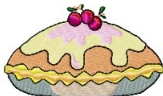
File: mxmas-67.jef Stitches: 9061 Size: 92.1x52.9 mm