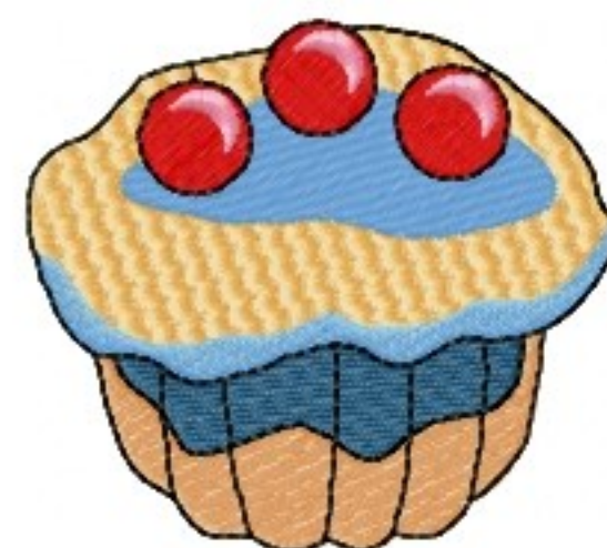
File: mxmas-66.jef Stitches: 9833 Size: 87.1x77.2 mm