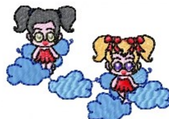
File: mxmas-39.jef Stitches: 8628 Size: 79.2x54.9 mm