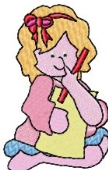
File: mxmas-68.jef Stitches: 9379 Size: 57.2x89.2 mm