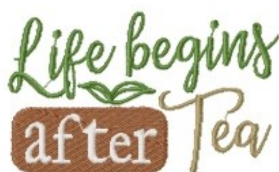
File: Life begins after tea Stitched 4_5 ....Inch Stitches: 10131 Colors: 4/4 Size: 114.4x67.7 mm Stops: 3