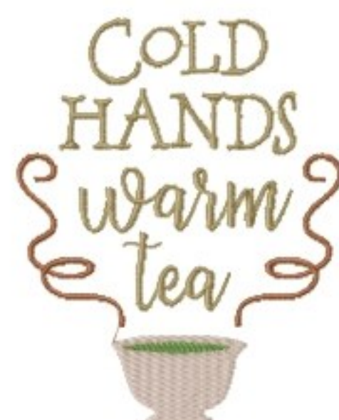
File: Cold hands, warm tea Stitched 5_...Inch Stitches: 10644 Colors: 4/5 Size: 113.2x139.6 mm Stops: 4