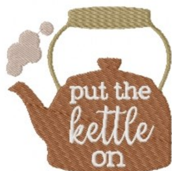
File: Put the kettle on Stitched 3_5 Inch.jef Stitches: 11046 Colors: 4/4 Size: 89.2x88.5 mm Stops: 3