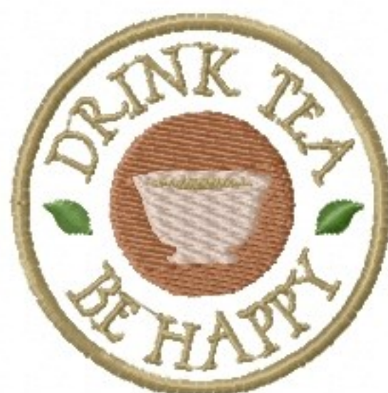
File: Drink Tea Be happy Stitched 2_5 ....Inch Stitches: 6203 Colors: 4/6 Size: 63.7x63.6 mm Stops: 5