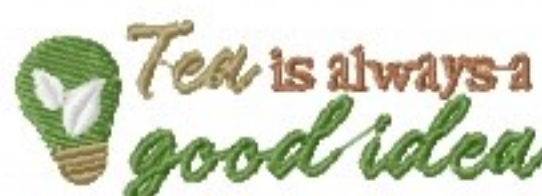
File: Tea is always a good idea Stiche...Inch Stitches: 4009 Colors: 4/5 Size: 76.3x25.7 mm Stops: 4