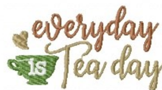
File: everyday is tea day Stitched 3 Inh.jef Stitches: 4868 Size: 76.2x40.5 mm Colors: 4/4 Stops: 3

1 Brown 2 Moss Green 3 White 4 Olive Drab