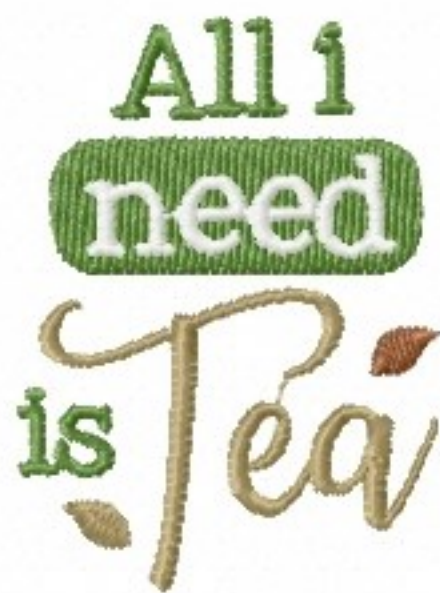
File: All i need is tea Stitched 2_5 Inch.jef Stitches: 4266 Colors: 4/5 Size: 47.3x63.6 mm Stops: 4