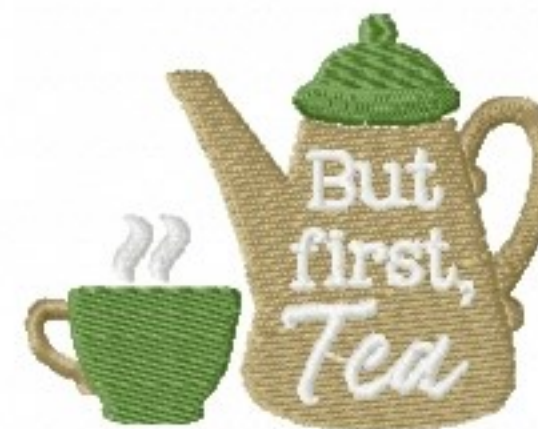
File: But first, Tea Stitched 3 Inch.jef Stitches: 6744 Colors: 4/4 Size: 76.3x58.6 mm Stops: 3