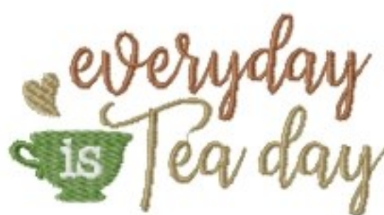
File: everyday is tea day Stitched 5 Inh.jef Stitches: 7995 Size: 127.0x67.7 mm Colors: 4/4 Stops: 3

1 Brown 2 Moss Green 3 White 4 Olive Drab