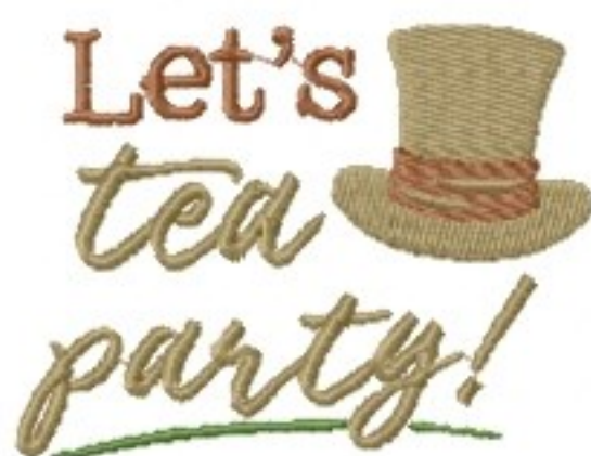
File: Let's tea party Stitched 3_5 Inch.jef Stitches: 6644 Size: 88.8x65.9 mm Colors: 3/4 Stops: 3

1 Olive Drab 2 Brown 3 Olive Drab 4 Moss Green