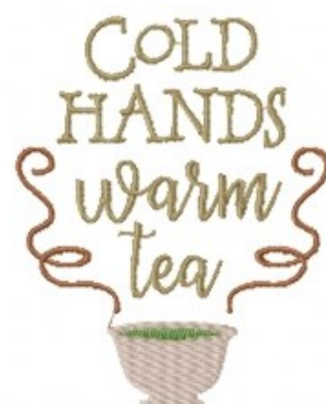
File: Cold hands, warm tea Stitched 4 Inch.jef Stitches: 7769 Colors: 4/5 Size: 82.5x101.4 mm Stops: 4