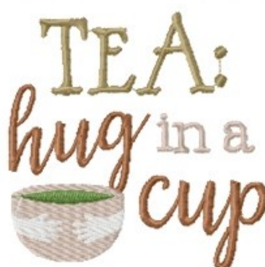
File: Tea hug in a cup Stitched 3_5 Inch.jef Stitches: 7368 Colors: 5/6 Size: 89.1x86.8 mm Stops: 5