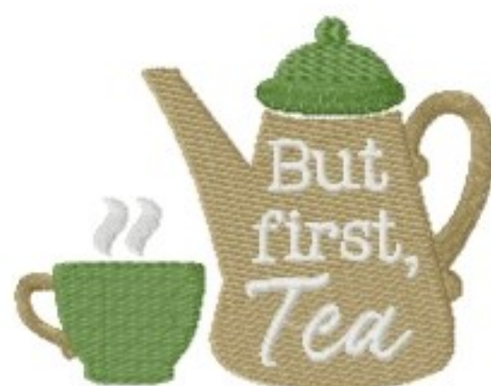
File: But first, Tea Stitched 5 Inch.jef Stitches: 15065 Colors: 4/4 Size: 127.1x97.7 mm Stops: 3