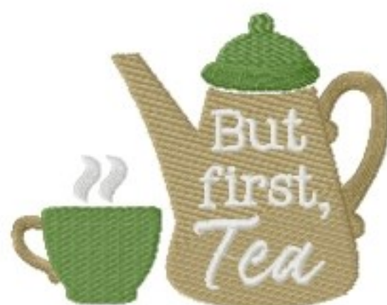
File: But first, Tea Stitched 5_5 Inch.jef Stitches: 17495 Colors: 4/4 Size: 139.9x107.6 mm Stops: 3