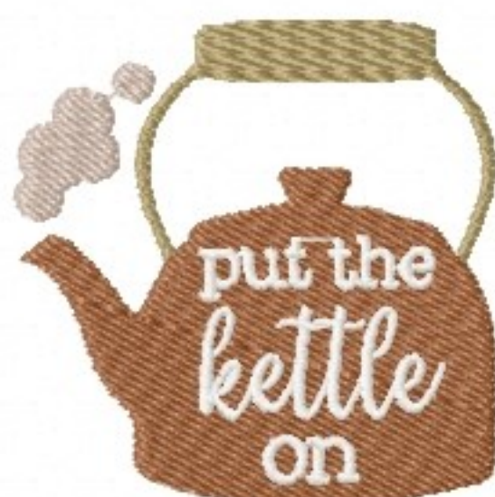
File: Put the kettle on Stitched 2_5 Inch.jef Stitches: 6822 Colors: 4/4 Size: 63.8x63.1 mm Stops: 3