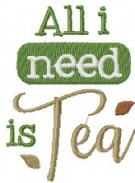
File: All i need is tea Stitched 4_5 Inch.jef Stitches: 8863 Colors: 4/5 Size: 85.0x114.4 mm Stops: 4