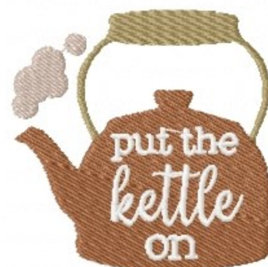
File: Put the kettle on Stitched 3 Inch.jef Stitches: 8770 Colors: 4/4 Size: 76.5x75.8 mm Stops: 3