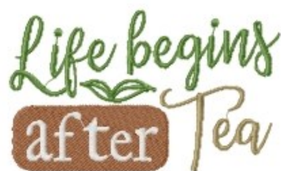
File: Life begins after tea Stitched 5_5 ....Inch Stitches: 13027 Colors: 4/4 Size: 139.8x82.7 mm Stops: 3