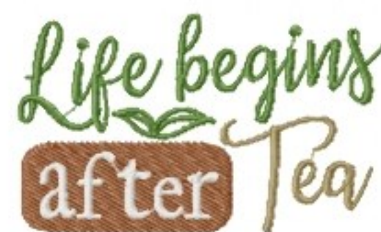
File: Life begins after tea Stitched 3_5 ....Inch Stitches: 7588 Colors: 4/4 Size: 89.0x52.6 mm Stops: 3