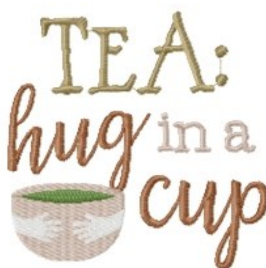
File: Tea hug in a cup Stitched 5 Inch.jef Stitches: 11382 Colors: 5/6 Size: 127.1x123.8 mm Stops: 5