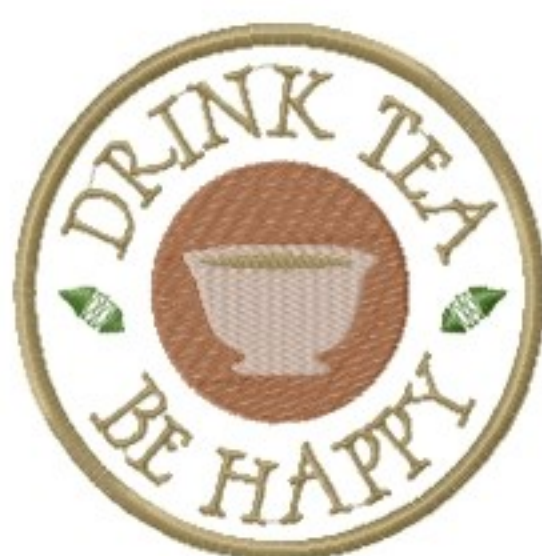
File: Drink Tea Be happy Stitched 5_5 ....Inch Stitches: 17388 Size: 139.9x139.7 mm Colors: 4/6 Stops: 5

1 Brown 2 Beige Gray 3 Olive Drab 4 Beige Gray 5 Moss Green 6 Olive Drab