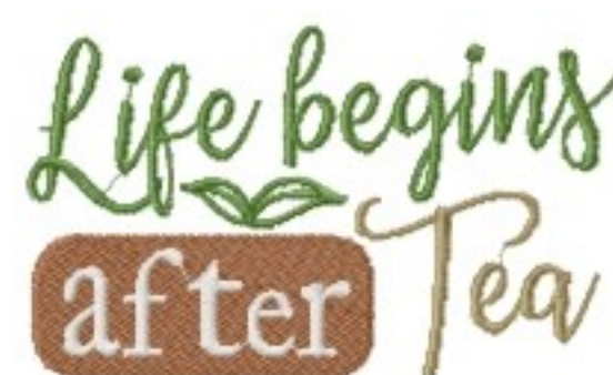
File: Life begins after tea Stitched 5 Inch.jef Stitches: 11535 Colors: 4/4 Size: 127.1x75.2 mm Stops: 3