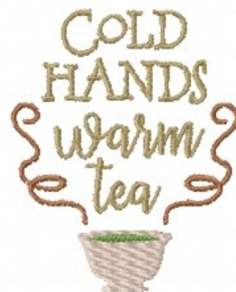
File: Cold hands, warm tea Stitched 2_...Inch Stitches: 4832 Colors: 4/5 Size: 51.5x63.4 mm Stops: 4