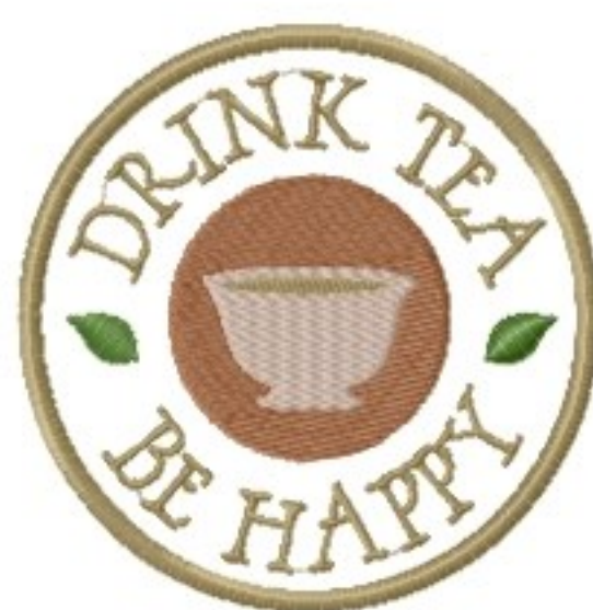
File: Drink Tea Be happy Stitched 4_5 ....Inch Stitches: 12963 Size: 114.5x114.2 mm Colors: 4/6 Stops: 5

1 Brown 2 Beige Gray 3 Olive Drab 4 Beige Gray 5 Moss Green 6 Olive Drab