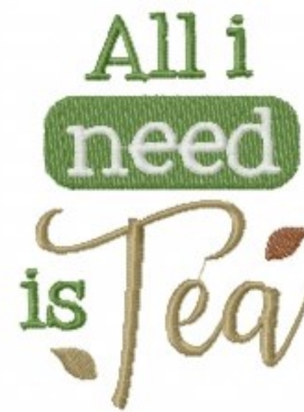
File: All i need is tea Stitched 5 Inch.jef Stitches: 10309 Colors: 4/5 Size: 94.4x127.1 mm Stops: 4