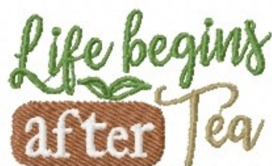
File: Life begins after tea Stitched 2_5 ....Inch Stitches: 5433 Colors: 4/4 Size: 63.5x37.7 mm Stops: 3