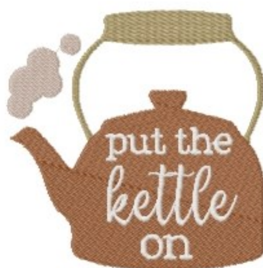
File: Put the kettle on Stitched 5 Inch.jef Stitches: 19219 Colors: 4/4 Size: 127.3x126.4 mm Stops: 3