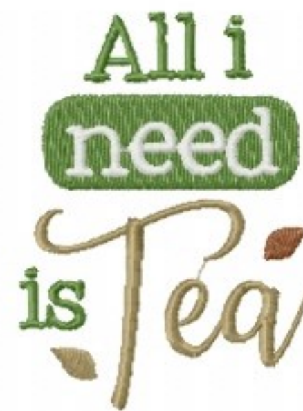
File: All i need is tea Stitched 3_5 Inch.jef Stitches: 6471 Colors: 4/5 Size: 66.2x89.0 mm Stops: 4