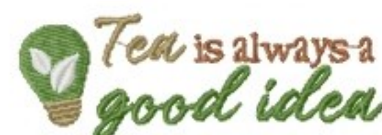
File: Tea is always a good idea Stiche...Inch Stitches: 4660 Colors: 4/5 Size: 89.0x30.0 mm Stops: 4