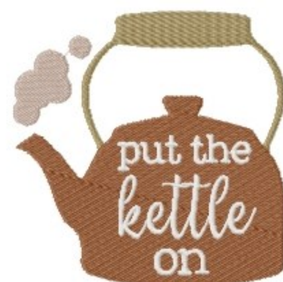
File: Put the kettle on Stitched 4_5 Inch.jef Stitches: 16202 Colors: 4/4 Size: 114.6x113.7 mm Stops: 3