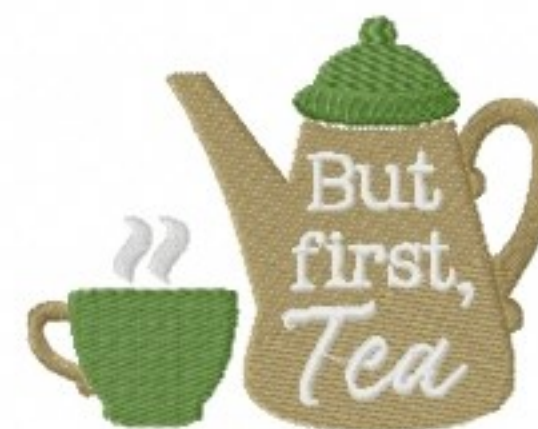
File: But first, Tea Stitched 4_5 Inch.jef Stitches: 12592 Colors: 4/4 Size: 114.5x88.0 mm Stops: 3