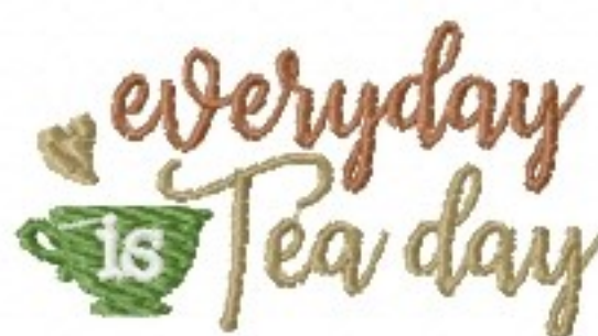
File: everyday is tea day Stitched 2_5 Inh.jef Stitches: 4115 Size: 63.5x34.0 mm Colors: 4/4 Stops: 3

1 Brown 2 Moss Green 3 White 4 Olive Drab