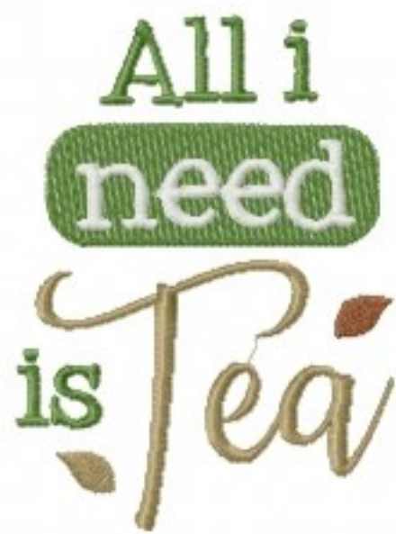
File: All i need is tea Stitched 5_5 Inch.jef Stitches: 11782 Colors: 4/5 Size: 104.0x139.8 mm Stops: 4