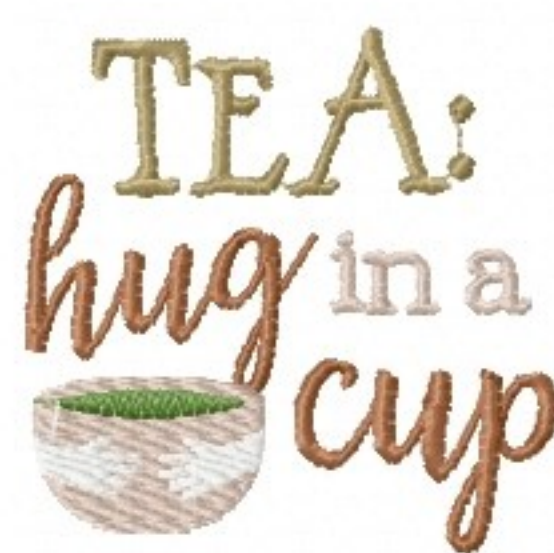
File: Tea hug in a cup Stitched 2_5 Inch.jef Stitches: 5030 Colors: 5/6 Size: 63.7x61.9 mm Stops: 5