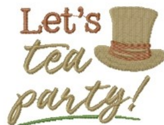
File: Let's tea party Stitched 4 Inch.jef Stitches: 7733 Size: 101.3x75.4 mm Colors: 3/4 Stops: 3

1 Olive Drab 2 Brown 3 Olive Drab 4 Moss Green