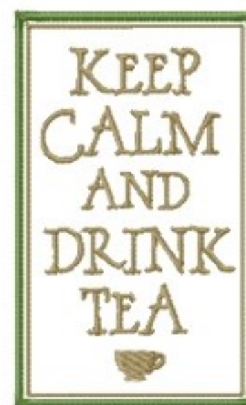
File: Keep calm and drink tea Stitched ...Inch Stitches: 11000 Size: 70.9x114.5 mm Colors: 2/3 Stops: 2