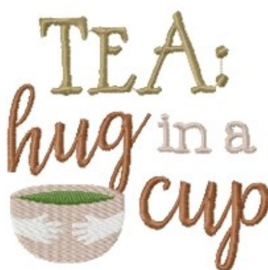
File: Tea hug in a cup Stitched 4_5 Inch.jef Stitches: 10138 Colors: 5/6 Size: 114.5x111.4 mm Stops: 5