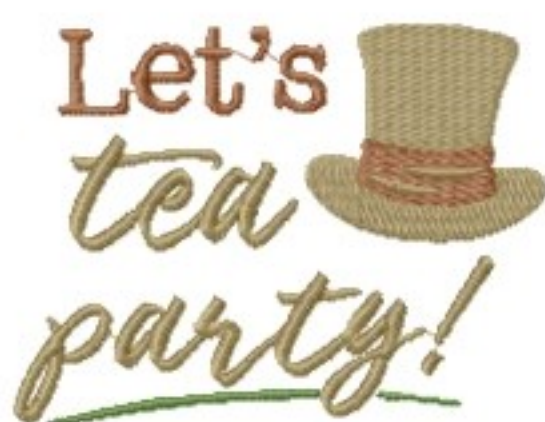
File: Let's tea party Stitched 5 Inch.jef Stitches: 10235 Size: 126.9x94.2 mm Colors: 3/4 Stops: 3

1 Olive Drab 2 Brown 3 Olive Drab 4 Moss Green