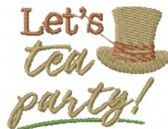
File: Let's tea party Stitched 2_5 Inch.jef Stitches: 4532 Size: 63.3x47.1 mm Colors: 3/4 Stops: 3

1 Olive Drab 2 Brown 3 Olive Drab 4 Moss Green