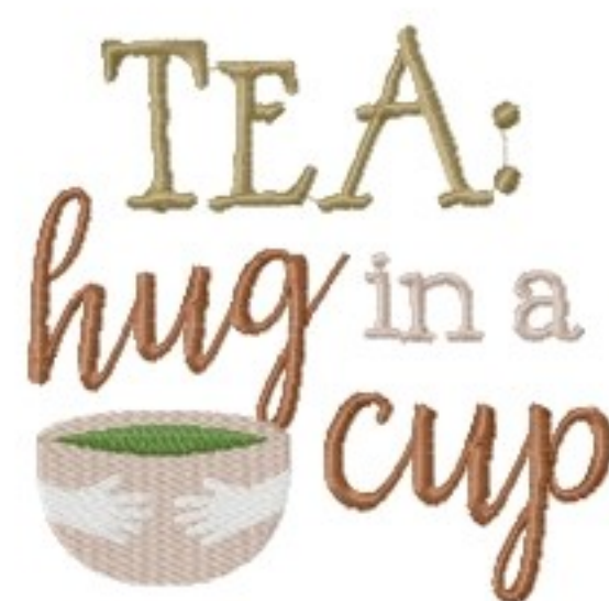
File: Tea hug in a cup Stitched 5_5 Inch.jef Stitches: 12990 Colors: 5/6 Size: 139.9x136.1 mm Stops: 5