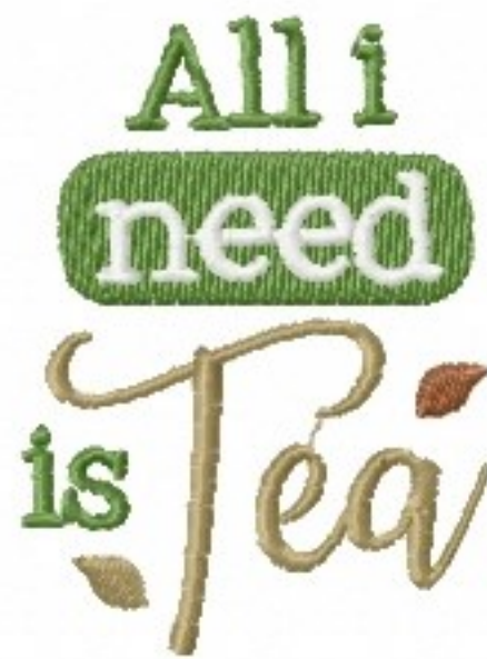
File: All i need is tea Stitched 3 Inch.jef Stitches: 5246 Colors: 4/5 Size: 56.7x76.3 mm Stops: 4