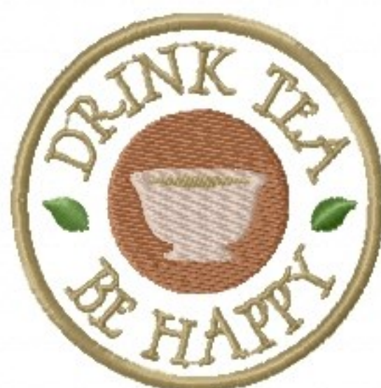
File: Drink Tea Be happy Stitched 3 Inch.jef Stitches: 7976 Colors: 4/6 Size: 76.3x76.3 mm Stops: 5