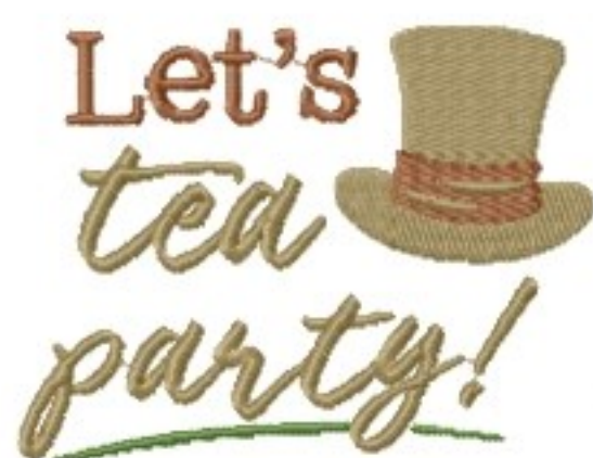
File: Let's tea party Stitched 4_5 Inch.jef Stitches: 9044 Size: 114.2x84.8 mm Colors: 3/4 Stops: 3

1 Olive Drab 2 Brown 3 Olive Drab 4 Moss Green