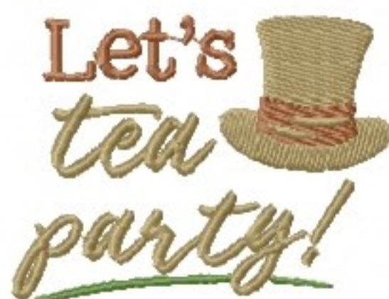
File: Let's tea party Stitched 3 Inch.jef Stitches: 5539 Size: 76.0x56.5 mm Colors: 3/4 Stops: 3

1 Olive Drab 2 Brown 3 Olive Drab 4 Moss Green