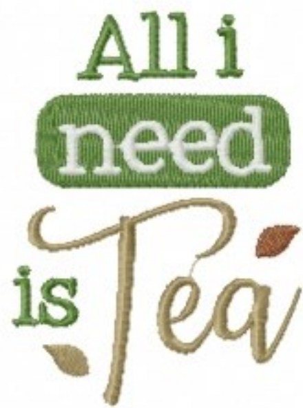
File: All i need is tea Stitched 4 Inch.jef Stitches: 7650 Colors: 4/5 Size: 75.5x101.7 mm Stops: 4