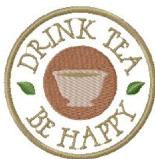
File: Drink Tea Be happy Stitched 4 Inch.jef Stitches: 11143 Size: 101.7x101.6 mm Colors: 4/6 Stops: 5

1 Brown 2 Beige Gray 3 Olive Drab 4 Beige Gray 5 Moss Green 6 Olive Drab