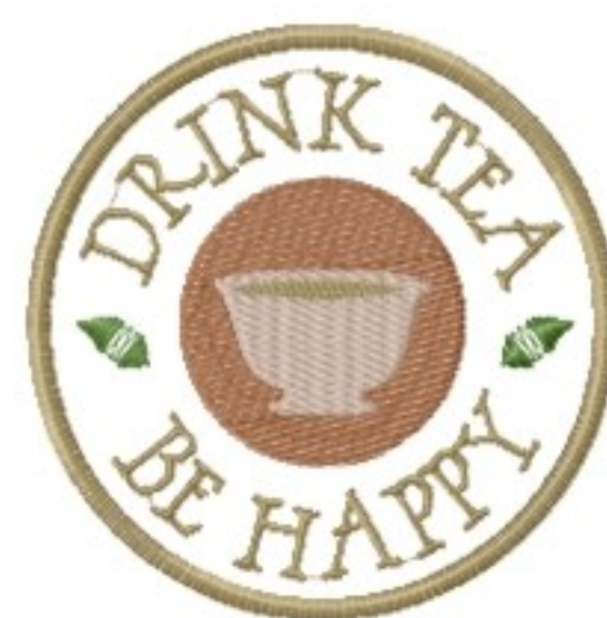
File: Drink Tea Be happy Stitched 5 Inch.jef Stitches: 14972 Size: 127.1x126.9 mm Colors: 4/6 Stops: 5

1 Brown 2 Beige Gray 3 Olive Drab 4 Beige Gray 5 Moss Green 6 Olive Drab