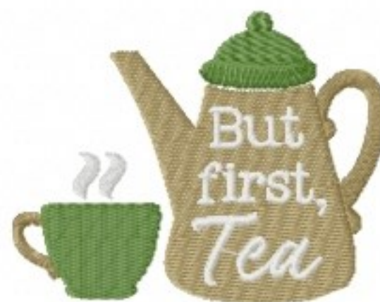
File: But first, Tea Stitched 4 Inch.jef Stitches: 10491 Colors: 4/4 Size: 101.7x78.2 mm Stops: 3