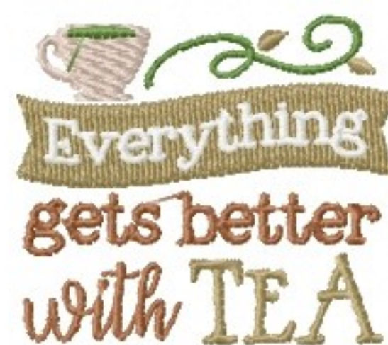
File: everything get better with tea Stit...Inch Stitches: 7890 Size: 63.3x54.5 mm Colors: 5/6 Stops: 5

1 Olive Drab 2 Beige Gray 3 Moss Green 4 White 5 Brown 6 Olive Drab