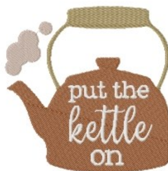
File: Put the kettle on Stitched 5_5 Inch.jef Stitches: 22593 Colors: 4/4 Size: 140.0x139.1 mm Stops: 3