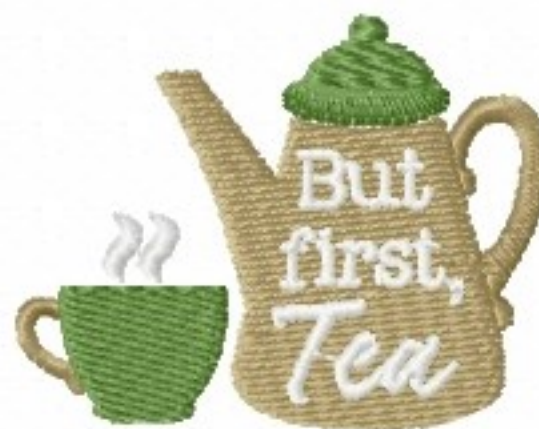
File: But first, Tea Stitched 2_5 Inch.jef Stitches: 5267 Colors: 4/4 Size: 63.7x48.9 mm Stops: 3