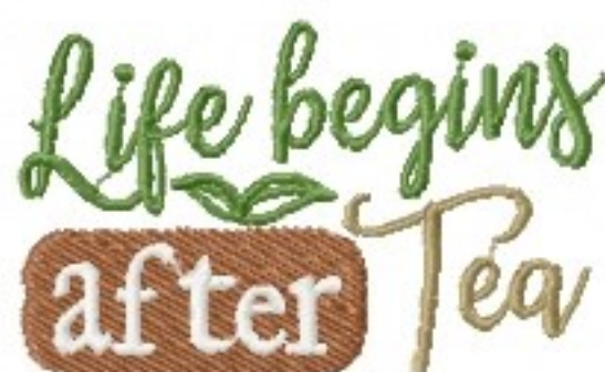
File: Life begins after tea Stitched 3 Inch.jef Stitches: 6517 Colors: 4/4 Size: 76.2x45.0 mm Stops: 3