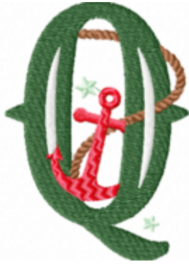
File: Q Stitched 3_5 Inch.jef Stitches: 7677 Size: 63.1x89.0 mm