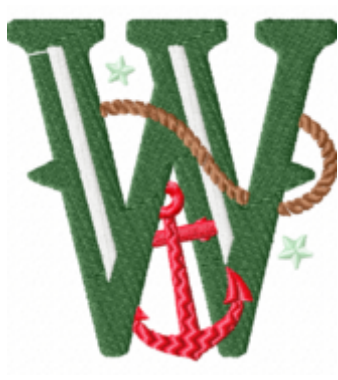
File: W Stitched 3_5 Inch.jef Stitches: 10826 Size: 85.9x88.6 mm