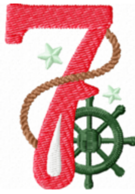
File: 7 Stitched 2_5 Inch.jef Stitches: 4242 Size: 45.0x63.6 mm Colors: 5/5 Stops: 4