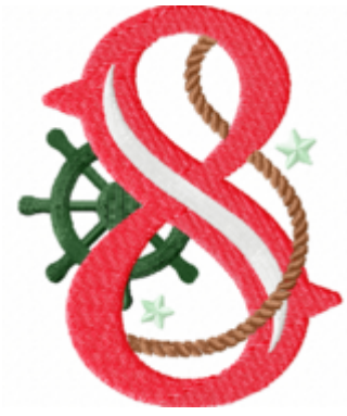
File: 8 Stitched 4 Inch.jef Stitches: 10133 Size: 82.0x101.8 mm Colors: 5/5 Stops: 4