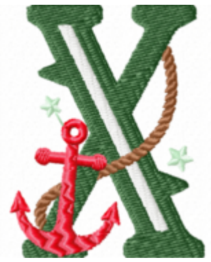
File: X Stitched 2_5 Inch.jef Stitches: 5548 Size: 48.6x63.6 mm