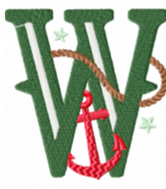
File: W Stitched 4 Inch.jef Stitches: 13227 Size: 98.0x101.6 mm