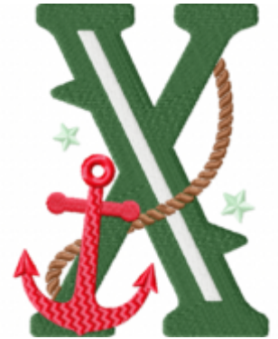
File: X Stitched 5_5 Inch.jef Stitches: 17153 Size: 106.8x139.9 mm