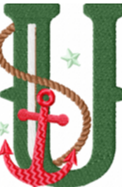
File: U Stitched 4_5 Inch.jef Stitches: 12578 Size: 85.1x114.0 mm Colors: 5/5 Stops: 4