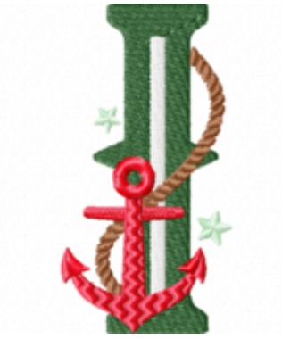
File: I Stitched 3_5 Inch.jef Stitches: 6802 Size: 45.7x89.0 mm