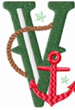
File: V Stitched 3 Inch.jef Stitches: 5965 Size: 52.3x76.4 mm