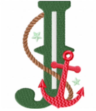
File: J Stitched 5 Inch.jef Stitches: 11612 Size: 81.4x127.2 mm