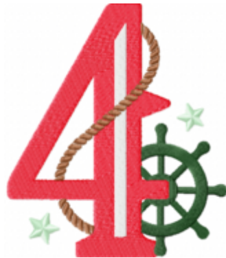
File: 4 Stitched 5_5 Inch.jef Stitches: 15949 Size: 121.1x139.9 mm