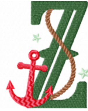
File: Z Stitched 3_5 Inch.jef Stitches: 7271 Size: 67.8x88.7 mm Colors: 4/4 Stops: 3