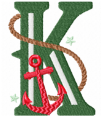
File: K Stitched 4 Inch.jef Stitches: 12979 Size: 77.6x101.8 mm