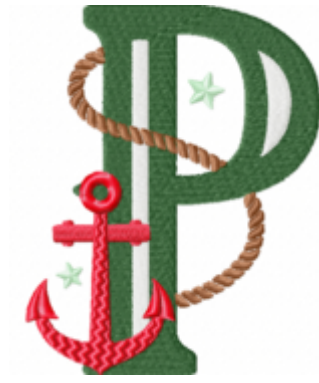
File: P Stitched 5 Inch.jef Stitches: 14644 Size: 101.3x127.2 mm Colors: 5/6 Stops: 5