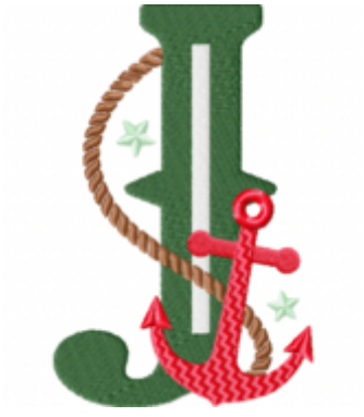
File: J Stitched 5_5 Inch.jef Stitches: 13373 Size: 89.6x139.8 mm