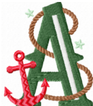
File: A Stitched 2_5 Inch.jef Stitches: 6289 Size: 53.1x63.5 mm