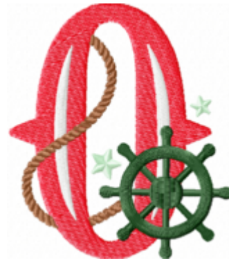
File: 0 Stitched 3_5 Inch.jef Stitches: 9846 Size: 77.4x89.0 mm