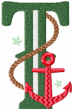
File: T Stitched 3_5 Inch.jef Stitches: 7345 Size: 57.4x89.0 mm Colors: 5/5 Stops: 4