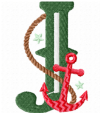
File: J Stitched 3 Inch.jef Stitches: 5752 Size: 49.0x76.4 mm