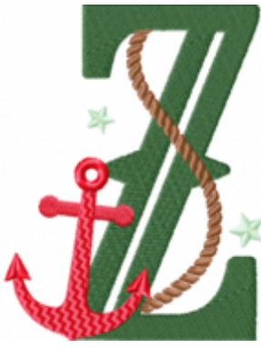
File: Z Stitched 5_5 Inch.jef Stitches: 13923 Size: 106.4x139.3 mm Colors: 4/4 Stops: 3