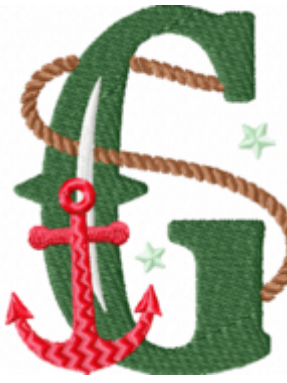
File: G Stitched 2_5 Inch.jef Stitches: 5351 Size: 50.7x63.5 mm Colors: 5/5 Stops: 4