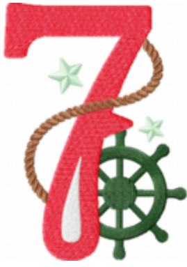
File: 7 Stitched 5 Inch.jef Stitches: 11393 Size: 89.8x127.2 mm Colors: 5/5 Stops: 4