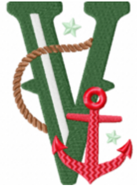
File: V Stitched 5 Inch.jef Stitches: 12510 Size: 86.9x127.2 mm