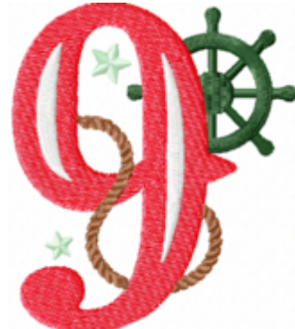
File: 9 Stitched 3_5 Inch.jef Stitches: 8940 Size: 76.8x89.0 mm