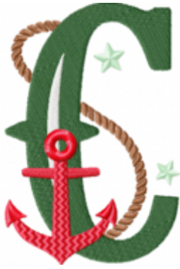
File: C Stitched 5_5 Inch.jef Stitches: 13383 Size: 93.1x139.5 mm