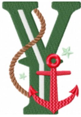
File: Y Stitched 5_5 Inch.jef Stitches: 14794 Size: 96.8x139.8 mm Colors: 5/5 Stops: 4