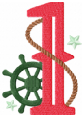
File: 1 Stitched 5 Inch.jef Stitches: 11440 Size: 87.6x127.2 mm Colors: 4/4 Stops: 3