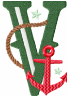
File: V Stitched 4_5 Inch.jef Stitches: 10618 Size: 78.2x114.5 mm