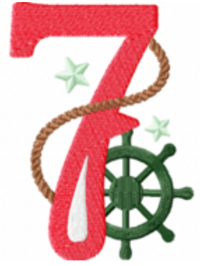
File: 7 Stitched 4_5 Inch.jef Stitches: 9590 Size: 80.9x114.4 mm Colors: 5/5 Stops: 4