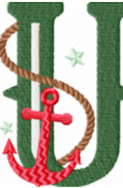
File: U Stitched 3_5 Inch.jef Stitches: 8792 Size: 66.2x88.9 mm Colors: 5/5 Stops: 4