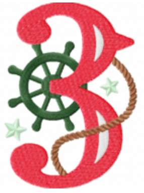
File: 3 Stitched 5 Inch.jef Stitches: 13071 Size: 90.0x127.2 mm