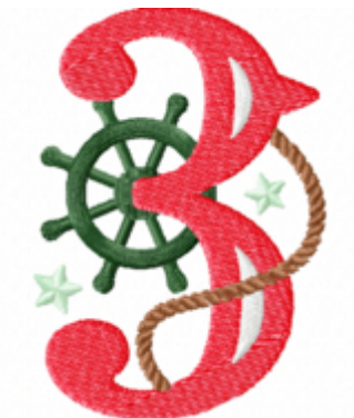
File: 3 Stitched 3_5 Inch.jef Stitches: 7634 Size: 63.1x89.0 mm Colors: 5/5 Stops: 4