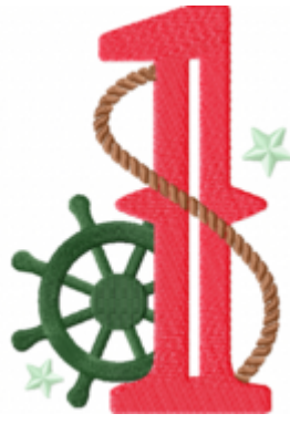
File: 1 Stitched 5_5 Inch.jef Stitches: 13219 Size: 96.5x139.8 mm Colors: 4/4 Stops: 3