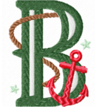
File: B Stitched 2_5 Inch.jef Stitches: 6112 Size: 48.3x63.4 mm Colors: 5/5 Stops: 4