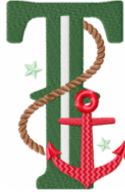
File: T Stitched 5_5 Inch.jef Stitches: 14190 Size: 90.2x139.8 mm Colors: 5/5 Stops: 4