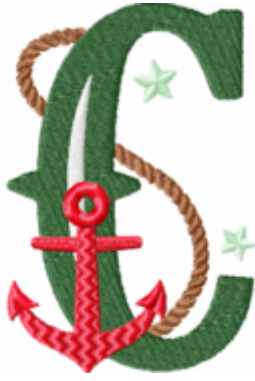
File: C Stitched 4 Inch.jef Stitches: 8577 Size: 67.6x101.4 mm