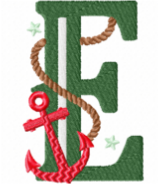
File: E Stitched 3 Inch.jef Stitches: 6518 Size: 49.9x75.8 mm