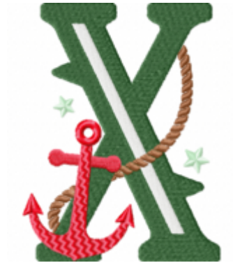
File: X Stitched 5 Inch.jef Stitches: 14865 Size: 97.2x127.2 mm