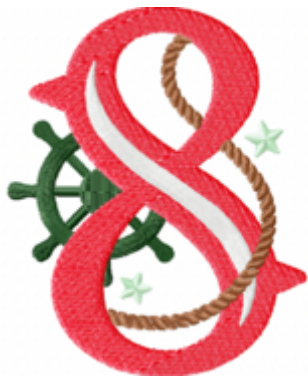
File: 8 Stitched 4_5 Inch.jef Stitches: 12113 Size: 92.2x114.5 mm