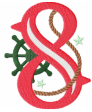
File: 8 Stitched 5_5 Inch.jef Stitches: 16564 Size: 112.8x139.8 mm