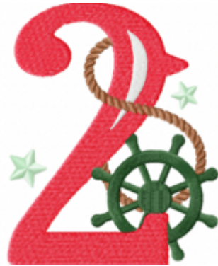
File: 2 Stitched 5 Inch.jef Stitches: 13773 Size: 102.1x127.1 mm Colors: 5/5 Stops: 4