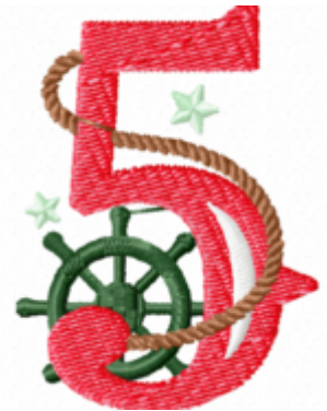
File: 5 Stitched 2_5 Inch.jef Stitches: 4975 Size: 47.2x63.6 mm