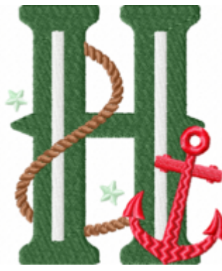
File: H Stitched 4 Inch.jef Stitches: 13079 Size: 85.9x101.5 mm