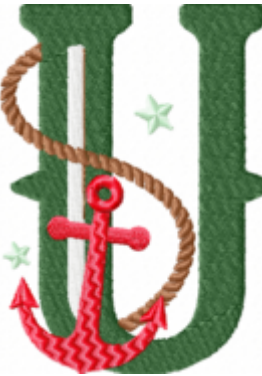
File: U Stitched 4 Inch.jef Stitches: 10614 Size: 75.6x101.4 mm Colors: 5/5 Stops: 4