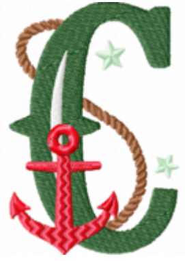
File: C Stitched 3_5 Inch.jef Stitches: 7139 Size: 59.3x88.7 mm