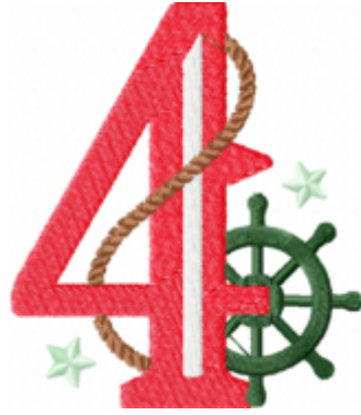
File: 4 Stitched 4 Inch.jef Stitches: 9628 Size: 88.0x101.8 mm