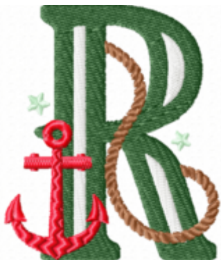
File: R Stitched 3 Inch.jef Stitches: 9734 Size: 63.5x76.4 mm