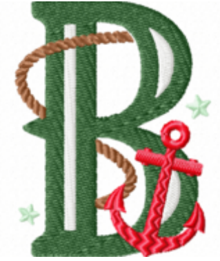
File: B Stitched 3 Inch.jef Stitches: 7893 Size: 57.9x76.2 mm Colors: 5/5 Stops: 4