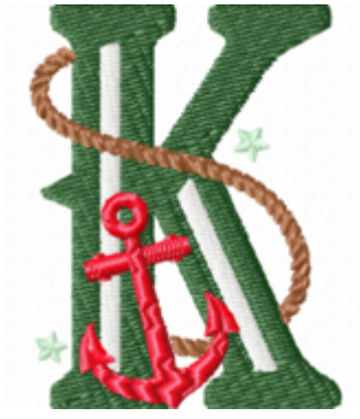
File: K Stitched 2_5 Inch.jef Stitches: 6638 Size: 48.7x63.6 mm