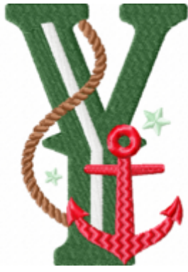
File: Y Stitched 4 Inch.jef Stitches: 9207 Size: 70.4x101.8 mm Colors: 5/5 Stops: 4