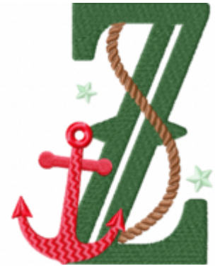
File: Z Stitched 5 Inch.jef Stitches: 12096 Size: 96.8x126.7 mm Colors: 4/4 Stops: 3