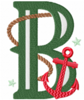
File: B Stitched 5 Inch.jef Stitches: 16642 Size: 96.5x126.8 mm Colors: 5/5 Stops: 4