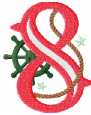
File: 8 Stitched 3_5 Inch.jef Stitches: 8474 Size: 71.7x89.0 mm Colors: 5/5 Stops: 4