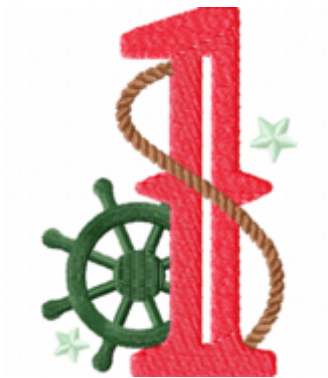
File: 1 Stitched 4 Inch.jef Stitches: 7985 Size: 70.1x101.8 mm