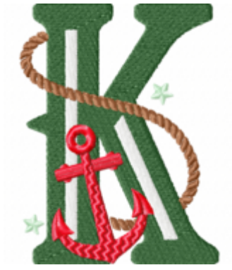
File: K Stitched 4_5 Inch.jef Stitches: 15326 Size: 87.3x114.6 mm