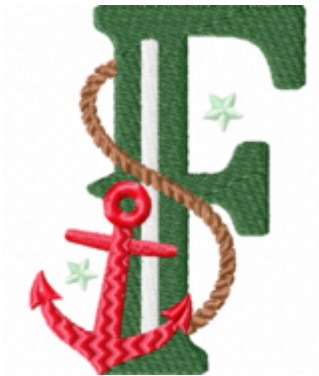
File: F Stitched 2_5 Inch.jef Stitches: 4958 Size: 47.2x63.4 mm