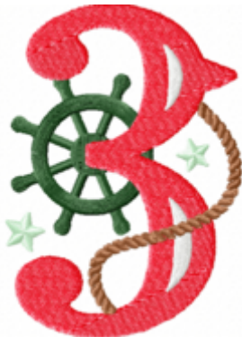
File: 3 Stitched 4 Inch.jef Stitches: 9236 Size: 71.9x101.8 mm