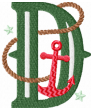
File: D Stitched 3_5 Inch.jef Stitches: 10504 Size: 74.8x89.0 mm