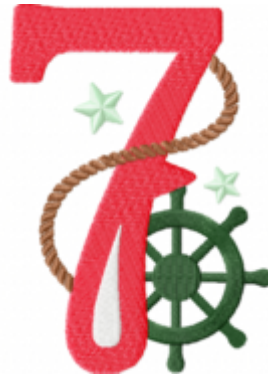
File: 7 Stitched 5_5 Inch.jef Stitches: 13272 Size: 98.9x139.8 mm Colors: 5/5 Stops: 4