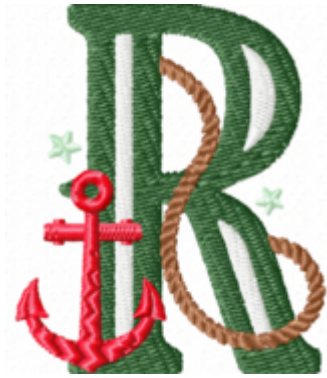
File: R Stitched 2_5 Inch.jef Stitches: 7483 Size: 52.9x63.6 mm