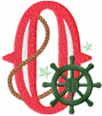
File: 0 Stitched 4 Inch.jef Stitches: 12026 Size: 88.5x101.8 mm