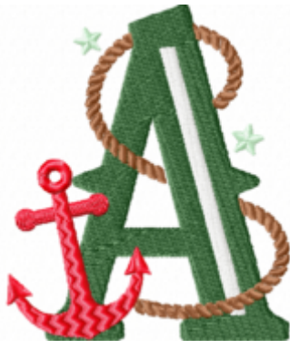
File: A Stitched 3_5 Inch.jef Stitches: 9777 Size: 74.4x89.0 mm Colors: 5/5 Stops: 4