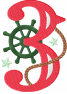
File: 3 Stitched 5_5 Inch.jef Stitches: 15288 Size: 98.9x139.8 mm