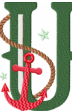
File: U Stitched 5 Inch.jef Stitches: 14715 Size: 94.7x126.8 mm Colors: 5/5 Stops: 4