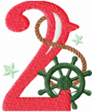
File: 2 Stitched 3 Inch.jef Stitches: 6451 Size: 61.4x76.3 mm Colors: 5/5 Stops: 4