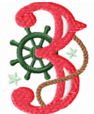
File: 3 Stitched 2_5 Inch.jef Stitches: 4735 Size: 44.9x63.6 mm Colors: 5/5 Stops: 4