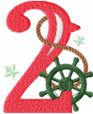
File: 2 Stitched 3_5 Inch.jef Stitches: 8010 Size: 71.6x89.1 mm Colors: 5/5 Stops: 4