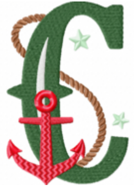
File: C Stitched 5 Inch.jef Stitches: 11615 Size: 84.7x126.9 mm