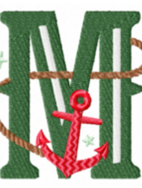
File: M Stitched 2_5 Inch.jef Stitches: 7985 Size: 62.1x63.7 mm Colors: 5/5 Stops: 4