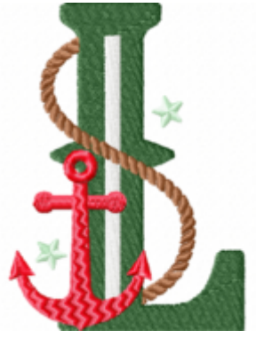
File: L Stitched 3 Inch.jef Stitches: 6541 Size: 54.8x76.4 mm Colors: 5/5 Stops: 4