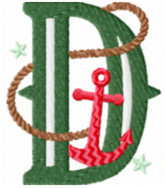
File: D Stitched 3 Inch.jef Stitches: 8515 Size: 64.2x76.4 mm