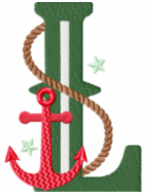
File: L Stitched 4_5 Inch.jef Stitches: 11370 Size: 82.0x114.4 mm Colors: 5/5 Stops: 4