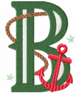
File: B Stitched 4_5 Inch.jef Stitches: 14039 Size: 86.9x114.1 mm Colors: 5/5 Stops: 4