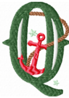
File: Q Stitched 2_5 Inch.jef Stitches: 4831 Size: 45.4x63.6 mm