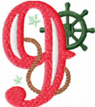
File: 9 Stitched 2_5 Inch.jef Stitches: 5585 Size: 54.9x63.6 mm