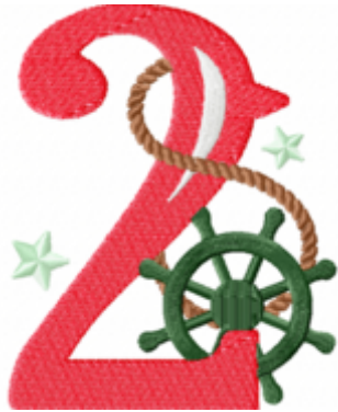
File: 2 Stitched 4_5 Inch.jef Stitches: 11573 Size: 91.9x114.5 mm Colors: 5/5 Stops: 4