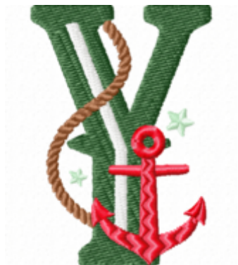
File: Y Stitched 2_5 Inch.jef Stitches: 4778 Size: 44.0x63.6 mm