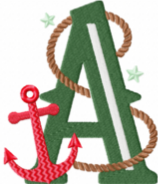
File: A Stitched 5 Inch.jef Stitches: 16093 Size: 106.1x127.1 mm Colors: 5/5 Stops: 4