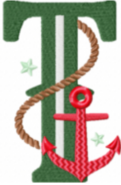
File: T Stitched 5 Inch.jef Stitches: 12373 Size: 82.0x127.2 mm Colors: 5/5 Stops: 4