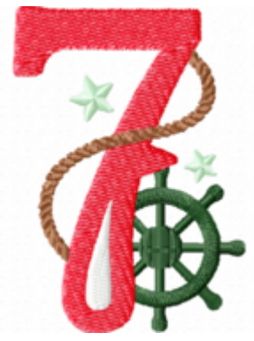
File: 7 Stitched 3 Inch.jef Stitches: 5388 Size: 53.9x76.4 mm Colors: 5/5 Stops: 4