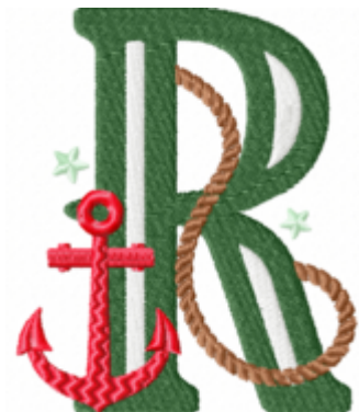
File: R Stitched 4 Inch.jef Stitches: 14708 Size: 84.7x101.8 mm