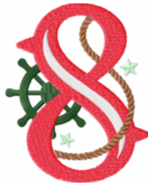
File: 8 Stitched 5 Inch.jef Stitches: 14215 Size: 102.4x127.2 mm