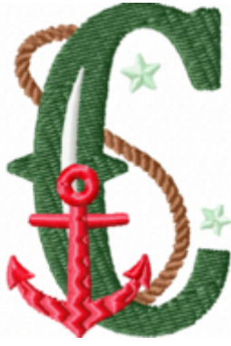
File: C Stitched 2_5 Inch.jef Stitches: 4619 Size: 42.3x63.4 mm