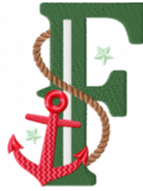
File: F Stitched 4_5 Inch.jef Stitches: 11260 Size: 84.8x114.1 mm Colors: 5/5 Stops: 4