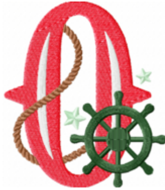
File: 0 Stitched 4_5 Inch.jef Stitches: 14140 Size: 99.5x114.4 mm