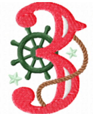
File: 3 Stitched 3 Inch.jef Stitches: 6134 Size: 54.1x76.4 mm Colors: 5/5 Stops: 4