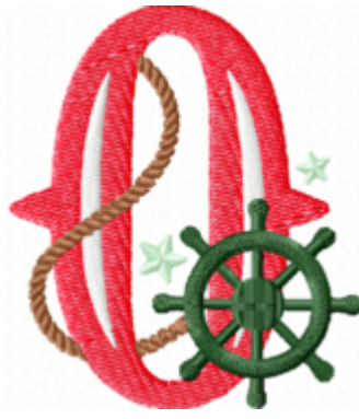
File: 0 Stitched 3 Inch.jef Stitches: 7959 Size: 66.4x76.4 mm