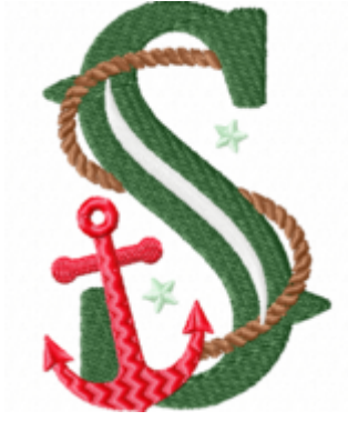
File: S Stitched 2_5 Inch.jef Stitches: 4999 Size: 44.4x63.3 mm Colors: 5/5 Stops: 4