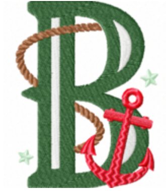
File: B Stitched 4 Inch.jef Stitches: 11871 Size: 77.2x101.5 mm Colors: 5/5 Stops: 4