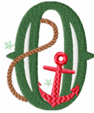
File: O Stitched 3_5 Inch.jef Stitches: 9096 Size: 74.0x89.0 mm Colors: 5/5 Stops: 4