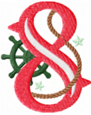
File: 8 Stitched 3 Inch.jef Stitches: 6866 Size: 61.5x76.4 mm Colors: 5/5 Stops: 4