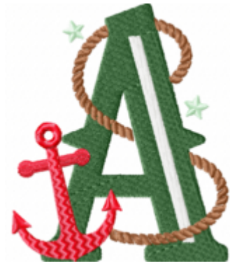
File: A Stitched 4_5 Inch.jef Stitches: 13789 Size: 95.5x114.4 mm Colors: 5/5 Stops: 4