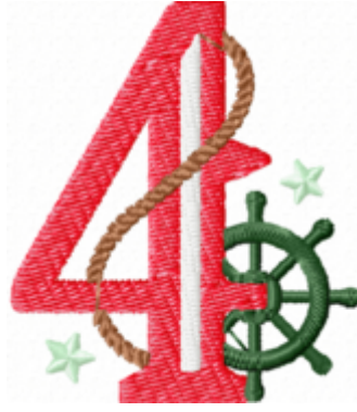
File: 4 Stitched 2_5 Inch.jef Stitches: 4988 Size: 55.3x63.6 mm