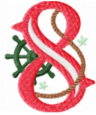
File: 8 Stitched 2_5 Inch.jef Stitches: 5370 Size: 51.4x63.6 mm Colors: 5/5 Stops: 4