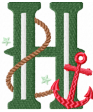
File: H Stitched 3_5 Inch.jef Stitches: 10783 Size: 75.1x88.9 mm