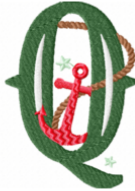
File: Q Stitched 4 Inch.jef Stitches: 9231 Size: 72.3x101.8 mm