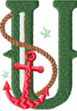
File: U Stitched 2_5 Inch.jef Stitches: 5490 Size: 47.3x63.4 mm Colors: 5/5 Stops: 4