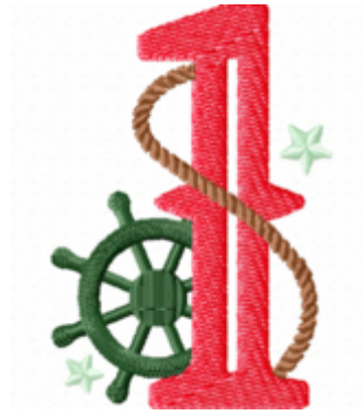
File: 1 Stitched 3 Inch.jef Stitches: 5373 Size: 52.6x76.4 mm