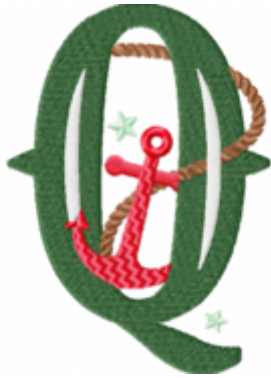
File: Q Stitched 5 Inch.jef Stitches: 12887 Size: 90.3x127.2 mm