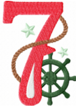
File: 7 Stitched 4 Inch.jef Stitches: 8079 Size: 72.0x101.8 mm Colors: 5/5 Stops: 4