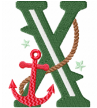
File: X Stitched 4_5 Inch.jef Stitches: 12718 Size: 87.5x114.4 mm