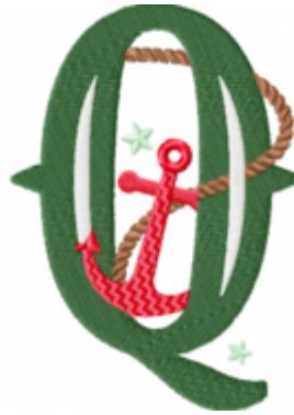
File: Q Stitched 5_5 Inch.jef Stitches: 14946 Size: 99.5x139.9 mm