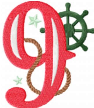
File: 9 Stitched 4_5 Inch.jef Stitches: 13069 Size: 98.9x114.4 mm