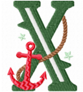
File: X Stitched 3 Inch.jef Stitches: 7035 Size: 58.4x76.4 mm