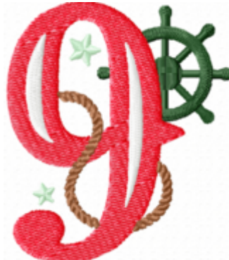
File: 9 Stitched 3 Inch.jef Stitches: 7196 Size: 66.0x76.4 mm