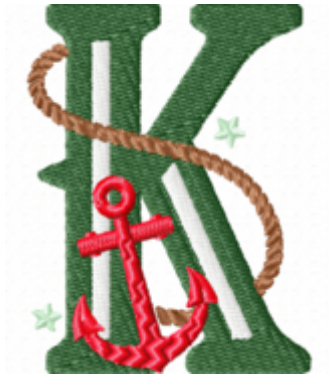
File: K Stitched 3 Inch.jef Stitches: 8669 Size: 58.4x76.4 mm