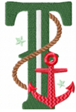
File: T Stitched 4_5 Inch.jef Stitches: 10705 Size: 73.9x114.4 mm Colors: 5/5 Stops: 4