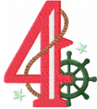
File: 4 Stitched 4_5 Inch.jef Stitches: 11470 Size: 99.2x114.4 mm