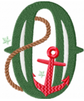
File: O Stitched 4_5 Inch.jef Stitches: 13228 Size: 95.0x114.4 mm Colors: 5/5 Stops: 4