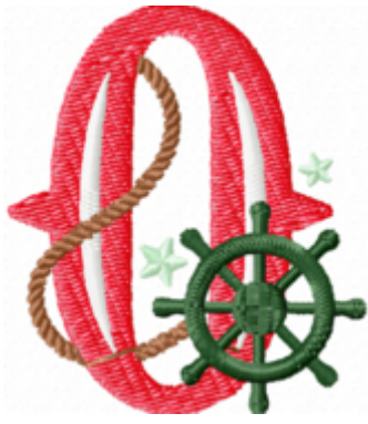
File: 0 Stitched 2_5 Inch.jef Stitches: 6194 Size: 55.3x63.6 mm