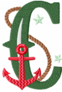
File: C Stitched 4_5 Inch.jef Stitches: 9989 Size: 76.1x114.1 mm