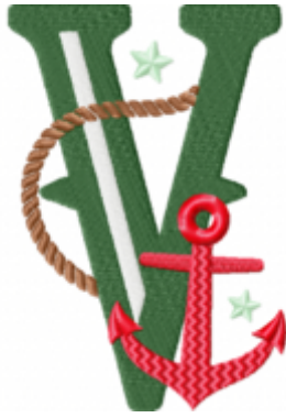
File: V Stitched 5_5 Inch.jef Stitches: 14367 Size: 95.5x139.9 mm