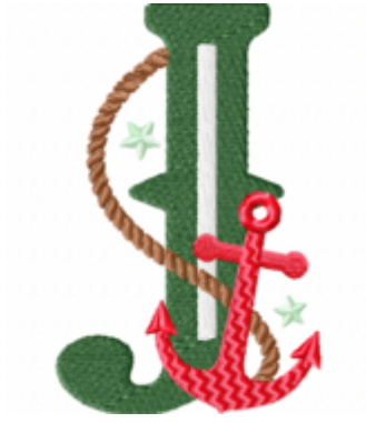
File: J Stitched 4_5 Inch.jef Stitches: 9895 Size: 73.3x114.5 mm