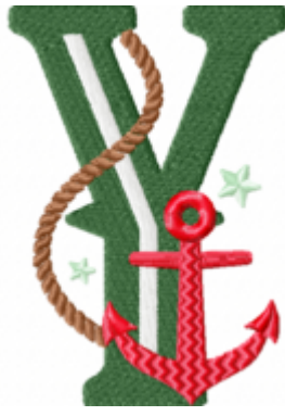
File: Y Stitched 4_5 Inch.jef Stitches: 11009 Size: 79.3x114.4 mm Colors: 5/5 Stops: 4