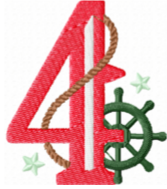
File: 4 Stitched 3 Inch.jef Stitches: 6458 Size: 66.2x76.4 mm