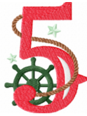
File: 5 Stitched 3 Inch.jef Stitches: 6432 Size: 56.9x76.4 mm