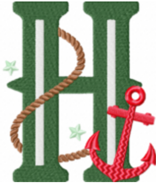
File: H Stitched 5 Inch.jef Stitches: 18215 Size: 107.1x126.8 mm