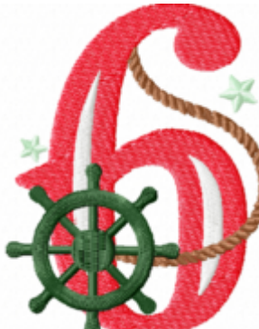
File: 6 Stitched 2_5 Inch.jef Stitches: 5972 Size: 50.4x63.6 mm