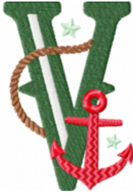
File: V Stitched 4 Inch.jef Stitches: 8963 Size: 69.6x101.8 mm