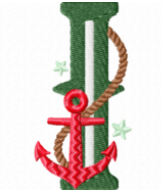
File: I Stitched 3 Inch.jef Stitches: 5477 Size: 39.2x76.4 mm