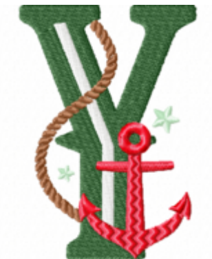
File: Y Stitched 3_5 Inch.jef Stitches: 7631 Size: 61.7x89.0 mm