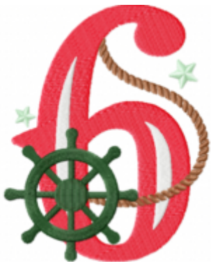
File: 6 Stitched 5_5 Inch.jef Stitches: 19057 Size: 110.6x139.8 mm Colors: 5/5 Stops: 4