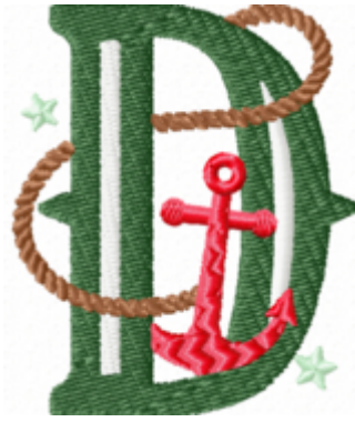
File: D Stitched 2_5 Inch.jef Stitches: 6583 Size: 53.4x63.6 mm