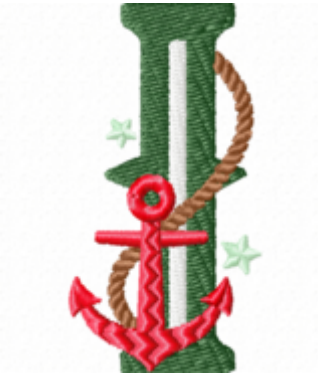
File: I Stitched 2_5 Inch.jef Stitches: 4331 Size: 32.9x63.6 mm