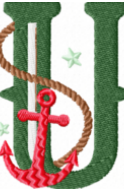
File: U Stitched 3.Inch.jef Stitches: 7056 Size: 56.7x76.1 mm Colors: 5/5 Stops: 4