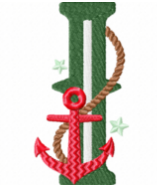
File: I Stitched 4 Inch.jef Stitches: 8260 Size: 52.4x101.8 mm