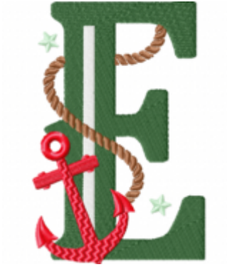
File: E Stitched 4_5 Inch.jef Stitches: 11609 Size: 74.8x114.1 mm