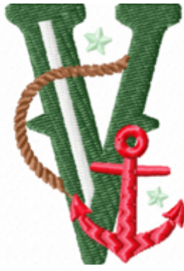
File: V Stitched 2_5 Inch.jef Stitches: 4568 Size: 43.4x63.7 mm