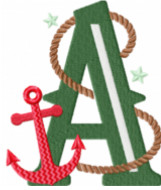
File: A Stitched 5_5 Inch.jef Stitches: 18272 Size: 116.8x139.8 mm Colors: 5/5 Stops: 4