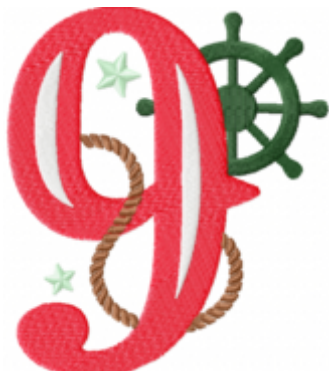
File: 9 Stitched 5_5 Inch.jef Stitches: 18001 Size: 120.8x139.8 mm