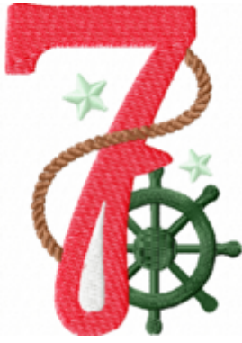
File: 7 Stitched 3_5 Inch.jef Stitches: 6638 Size: 62.8x89.0 mm Colors: 5/5 Stops: 4