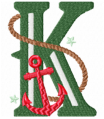
File: K Stitched 3_5 Inch.jef Stitches: 10738 Size: 68.0x89.1 mm