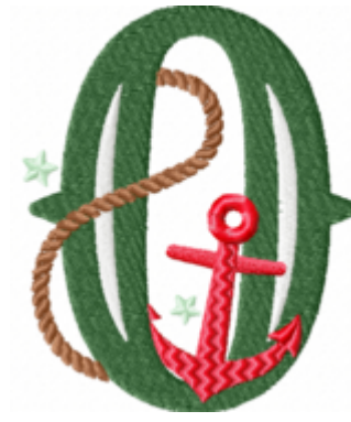
File: O Stitched 4 Inch.jef Stitches: 11074 Size: 84.3x101.8 mm Colors: 5/5 Stops: 4