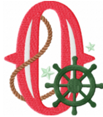
File: 0 Stitched 5 Inch.jef Stitches: 16870 Size: 110.5x127.2 mm