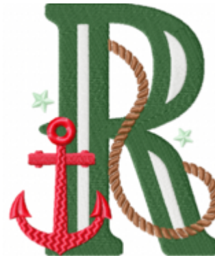
File: R Stitched 4_5 Inch.jef Stitches: 17261 Size: 95.3x114.4 mm Colors: 5/5 Stops: 4