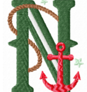
File: N Stitched 2_5 Inch.jef Stitches: 5858 Size: 50.1x63.6 mm