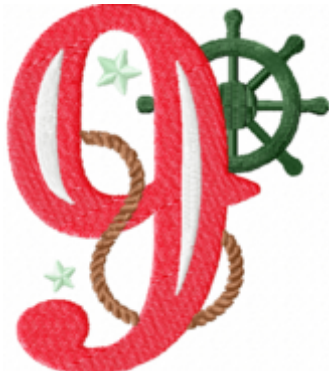
File: 9 Stitched 4 Inch.jef Stitches: 10839 Size: 87.9x101.8 mm