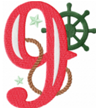
File: 9 Stitched 5 Inch.jef Stitches: 15481 Size: 109.9x127.2 mm