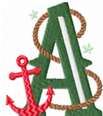
File: A Stitched 3 Inch.jef Stitches: 7878 Size: 63.8x76.3 mm