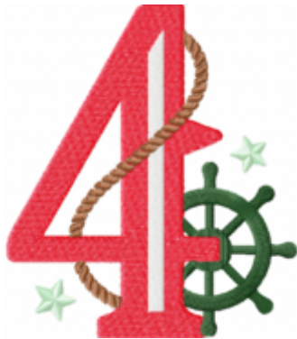
File: 4 Stitched 5 Inch.jef Stitches: 13627 Size: 110.2x127.2 mm