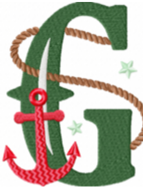
File: G Stitched 4 Inch.jef Stitches: 9943 Size: 81.2x101.5 mm Colors: 5/5 Stops: 4