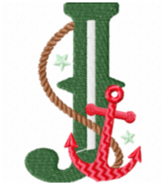
File: J Stitched 3_5 Inch.jef Stitches: 7011 Size: 57.1x89.0 mm