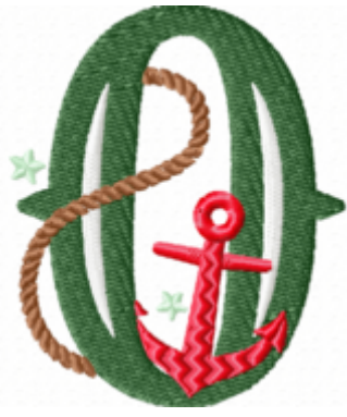
File: O Stitched 3 Inch.jef Stitches: 7314 Size: 63.3x76.4 mm Colors: 5/5 Stops: 4