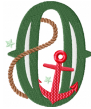
File: O Stitched 5_5 Inch.jef Stitches: 17963 Size: 116.1x139.9 mm Colors: 5/5 Stops: 4