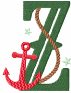
File: Z Stitched 4_5 Inch.jef Stitches: 10385 Size: 87.2x114.0 mm Colors: 4/4 Stops: 3