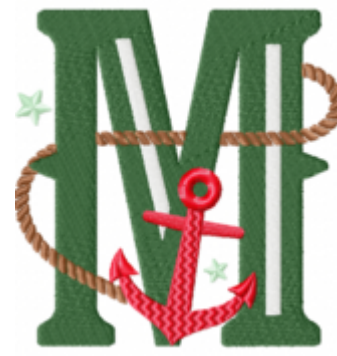
File: M Stitched 5 Inch.jef Stitches: 21951 Size: 124.4x127.2 mm