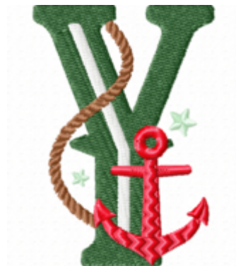
File: Y Stitched 3 Inch.jef Stitches: 6102 Size: 52.9x76.4 mm