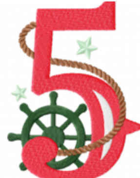
File: 5 Stitched 4_5 Inch.jef Stitches: 11118 Size: 85.0x114.4 mm