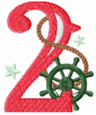
File: 2 Stitched 2_5 Inch.jef Stitches: 5002 Size: 51.0x63.7 mm Colors: 5/5 Stops: 4