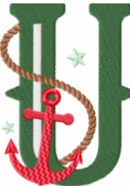
File: U Stitched 5_5 Inch.jef Stitches: 17035 Size: 104.0x139.5 mm Colors: 5/5 Stops: 4