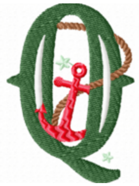
File: Q Stitched 3 Inch.jef Stitches: 6092 Size: 54.2x76.4 mm