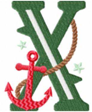
File: X Stitched 4 Inch.jef Stitches: 10807 Size: 77.9x101.8 mm