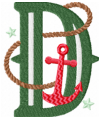
File: D Stitched 4 Inch.jef Stitches: 12639 Size: 85.5x101.8 mm