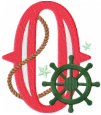
File: 0 Stitched 5_5 Inch.jef Stitches: 19621 Size: 121.5x139.8 mm