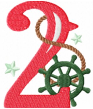
File: 2 Stitched 4 Inch.jef Stitches: 9697 Size: 81.7x101.8 mm Colors: 5/5 Stops: 4