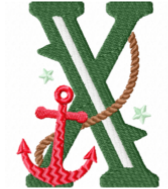
File: X Stitched 3_5 Inch.jef Stitches: 8916 Size: 68.0x89.1 mm