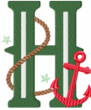
File: H Stitched 5_5 Inch.jef Stitches: 21071 Size: 118.1x139.5 mm