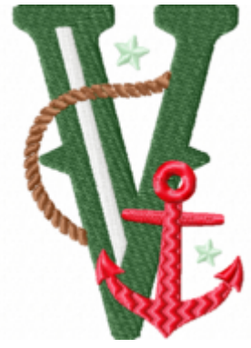
File: V Stitched 3_5 Inch.jef Stitches: 7521 Size: 60.9x89.1 mm