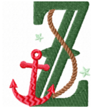
File: Z Stitched 3 Inch.jef Stitches: 5892 Size: 58.0x76.1 mm Colors: 4/4 Stops: 3