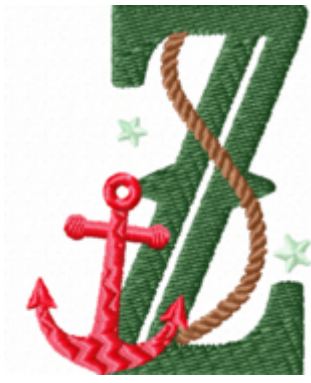
File: Z Stitched 2_5 Inch.jef Stitches: 4625 Size: 48.4x63.4 mm Colors: 4/4 Stops: 3