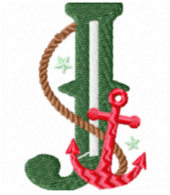
File: J Stitched 2_5 Inch.jef Stitches: 4452 Size: 40.8x63.6 mm