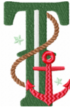
File: T Stitched 4 Inch.jef Stitches: 8906 Size: 65.5x101.8 mm Colors: 5/5 Stops: 4