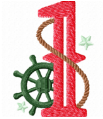
File: 1 Stitched 2_5 Inch.jef Stitches: 4313 Size: 43.7x63.6 mm