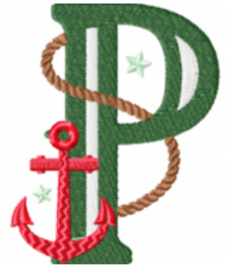
File: P Stitched 4 Inch.jef Stitches: 10510 Size: 80.9x101.8 mm Colors: 5/6 Stops: 5