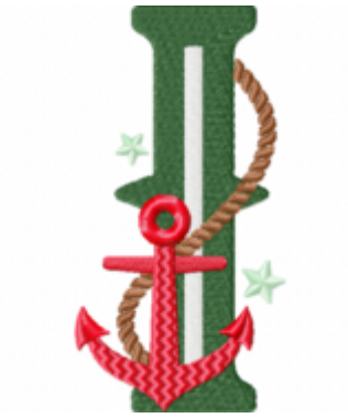
File: I Stitched 5 Inch.jef Stitches: 11204 Size: 65.3x127.2 mm