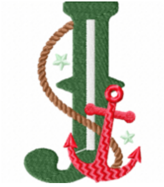
File: J Stitched 4 Inch.jef Stitches: 8462 Size: 65.2x101.8 mm