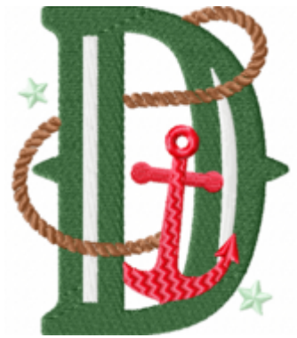
File: D Stitched 4_5 Inch.jef Stitches: 15072 Size: 96.2x114.5 mm