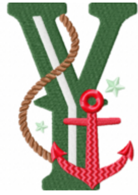
File: Y Stitched 5 Inch.jef Stitches: 12775 Size: 87.8x127.2 mm Colors: 5/5 Stops: 4