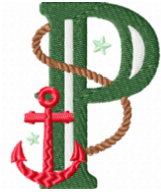
File: P Stitched 3 Inch.jef Stitches: 7031 Size: 60.9x76.4 mm Colors: 5/6 Stops: 5