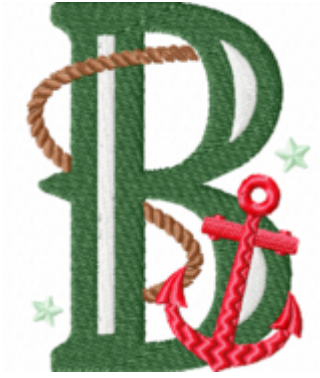
File: B Stitched 3_5 Inch.jef Stitches: 9811 Size: 67.6x88.8 mm Colors: 5/5 Stops: 4