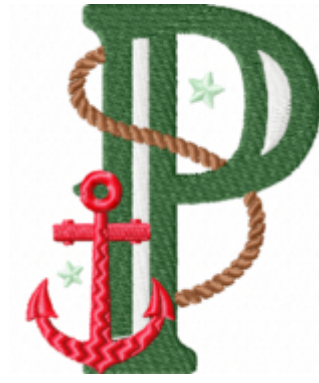
File: P Stitched 3_5 Inch.jef Stitches: 8767 Size: 70.8x89.0 mm Colors: 5/6 Stops: 5