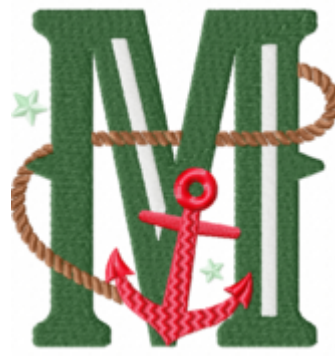
File: M Stitched 4_5 Inch.jef Stitches: 18649 Size: 111.9x114.4 mm