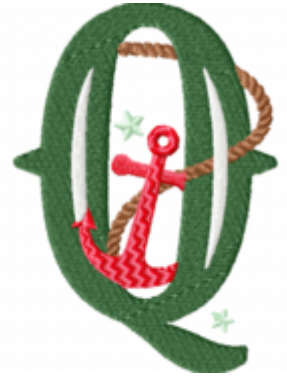
File: Q Stitched 4_5 Inch.jef Stitches: 11114 Size: 81.5x114.5 mm